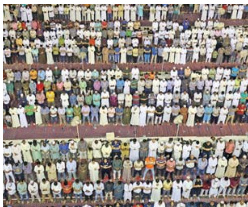
Worshippers perform the qiyam prayer outside the Grand Mosque on the 27th night of this past Ramadan.