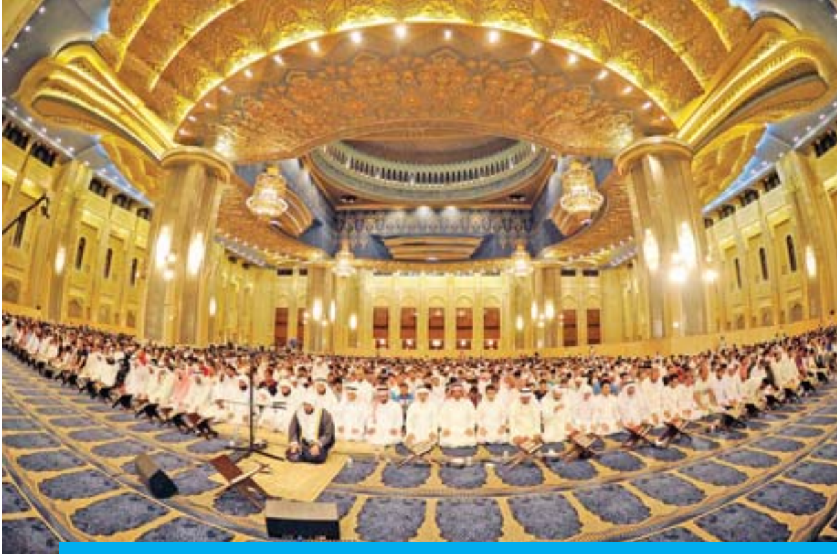
KUWAIT: Worshippers perform the qiyam prayer inside the Grand Mosque.