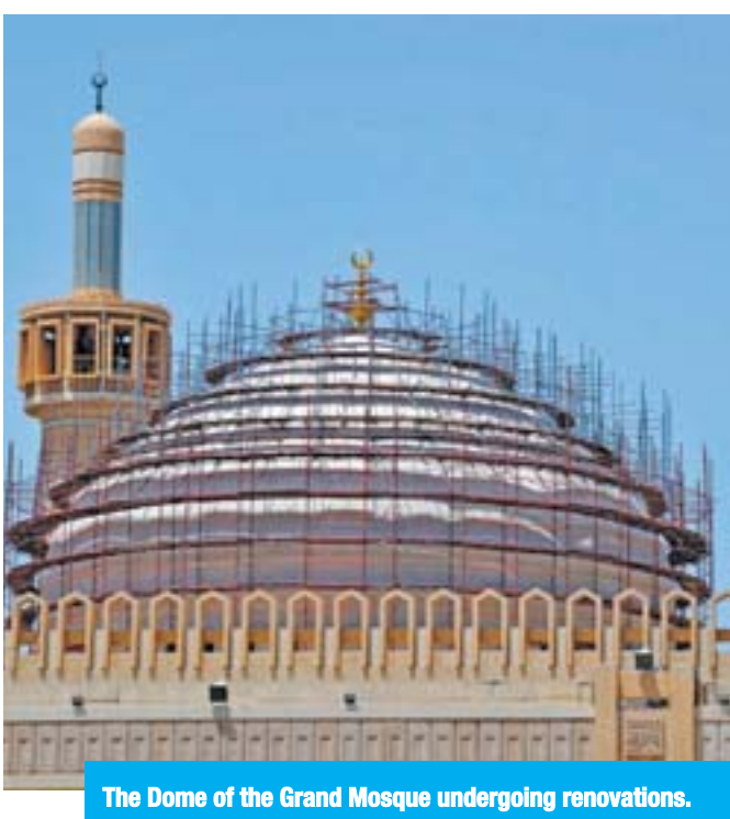
The Dome of the Grand Mosque undergoing renovations.