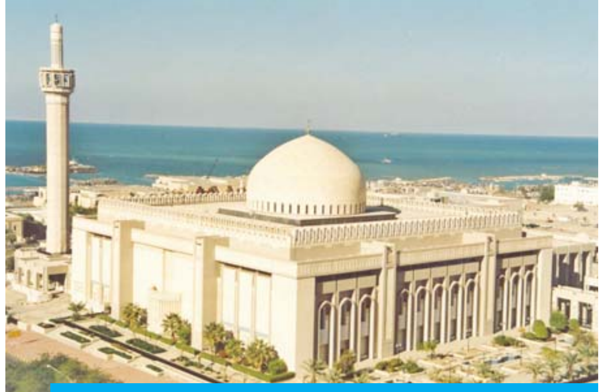
The Grand Mosque.