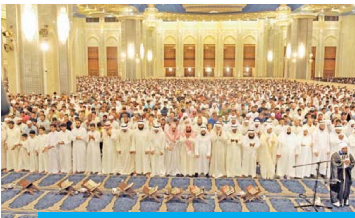
Crowds of worshippers perform the qiyam prayer in the Grand Mosque on the 27th night of Ramadan.