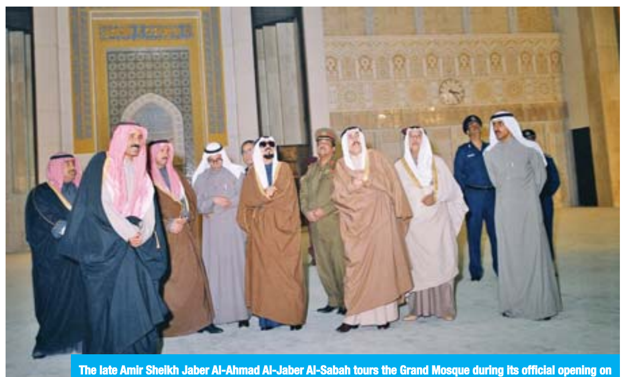
The late Amir Sheikh Jaber Al-Ahmad Al-Jaber Al-Sabah tours the Grand Mosque during its official opening on January 27, 1986.