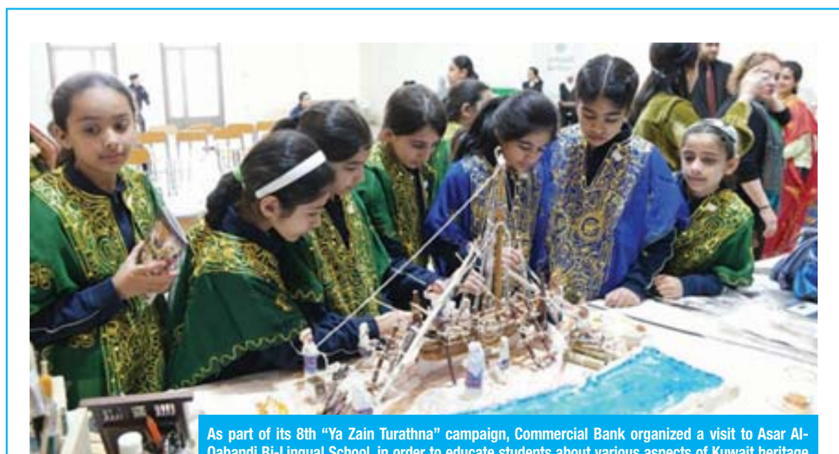
As part of its 8th "Ya Zain Turathna" campaign, Commercial Bank organized a visit to Asar Al-Qabandi Bi-Lingual School, in order to educate students about various aspects of Kuwait heritage as well as old Kuwaiti traditions.