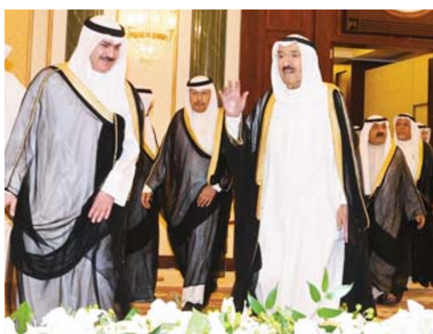
KUWAIT: His Highness the Amir Sheikh Sabah Al-Ahmad Al-Jaber Al-Sabah and Al-Sabah family received Tuesday senior foreign ministry officials, top officers of the army, police, national guard and fire department, as well as diplomats on the occasion of the holy month of Ramadan. (See Page 4)