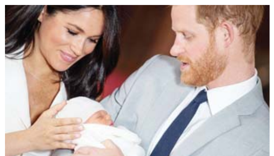
WINDSOR: Britain's Prince Harry, Duke of Sussex and his wife Meghan, Duchess of Sussex, pose for a photo with their newborn baby son in St George's Hall at Windsor Castle yesterday.