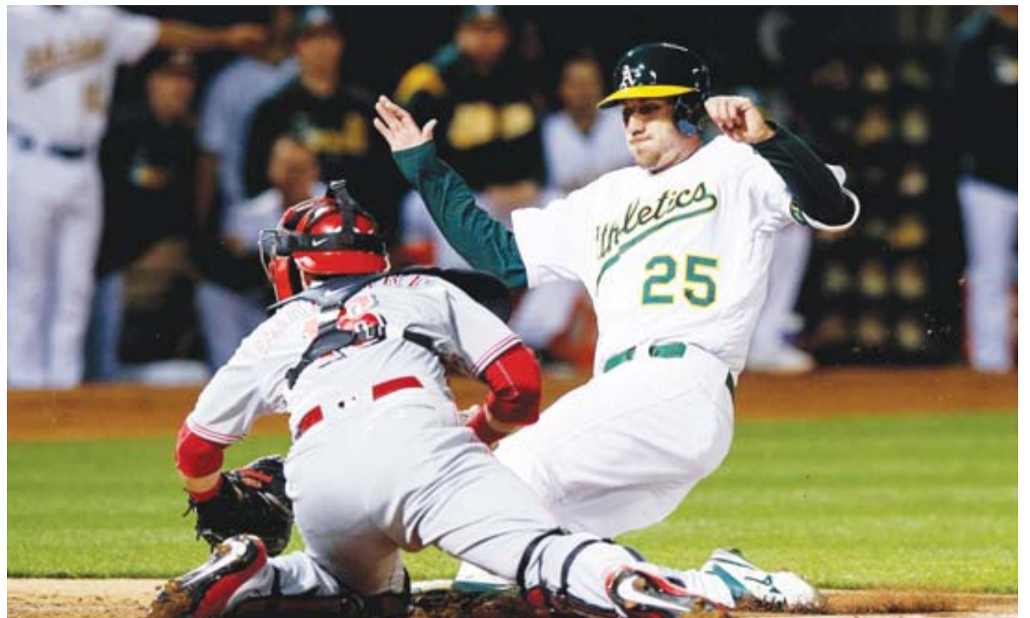
OAKLAND: Stephen Piscotty #25 of the Oakland Athletics slides into home plate to score a run ahead of a tag from Tucker Barnhart #16 of the Cincinnati Reds during the second inning at the Oakland Coliseum in Oakland, California. The Oakland Athletics defeated the Cincinnati Reds 2-0. — AFP

The code of conduct panel could decide to fire Folau, or issue fines or suspensions. No timescale was given for its decision, with legal experts warning that whatever happens an appeal is likely, potentially followed by a drawn-out court battle. — AFP