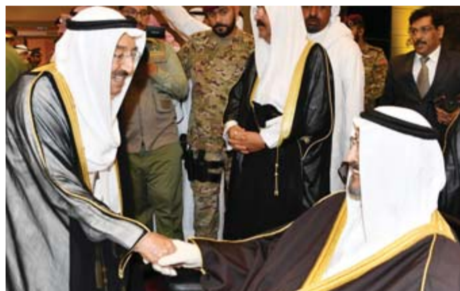
His Highness the Amir Sheikh Sabah Al-Ahmad Al-Jaber Al-Sabah is welcomed by Kuwait National Guard President His Highness Sheikh Salem Al-Ali Al-Sabah.