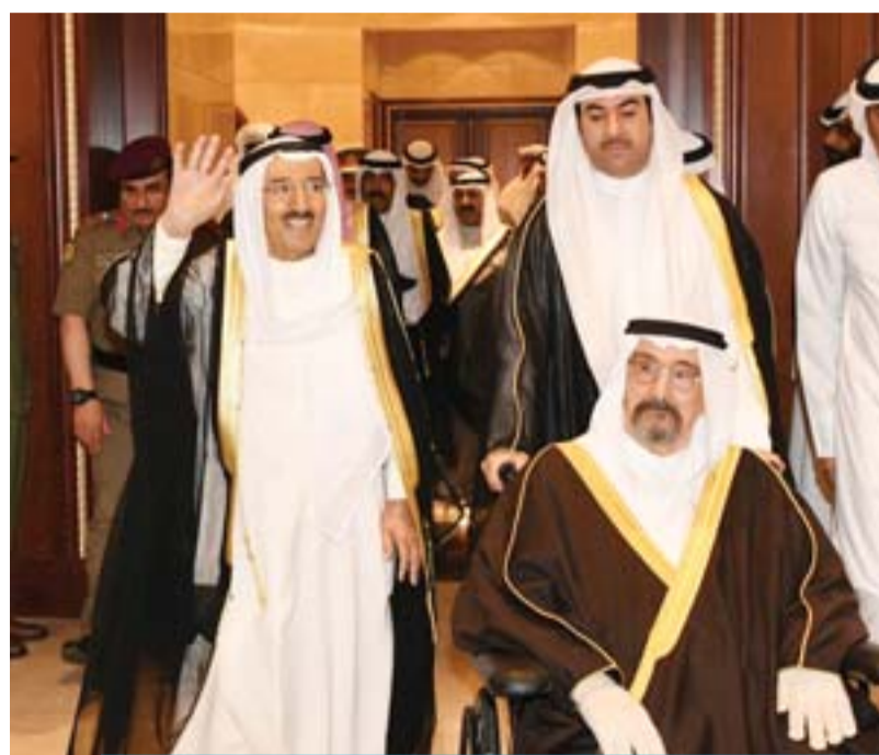
His Highness the Amir Sheikh Sabah Al-Ahmad Al-Jaber Al-Sabah greets officers at the Kuwait National Guard.