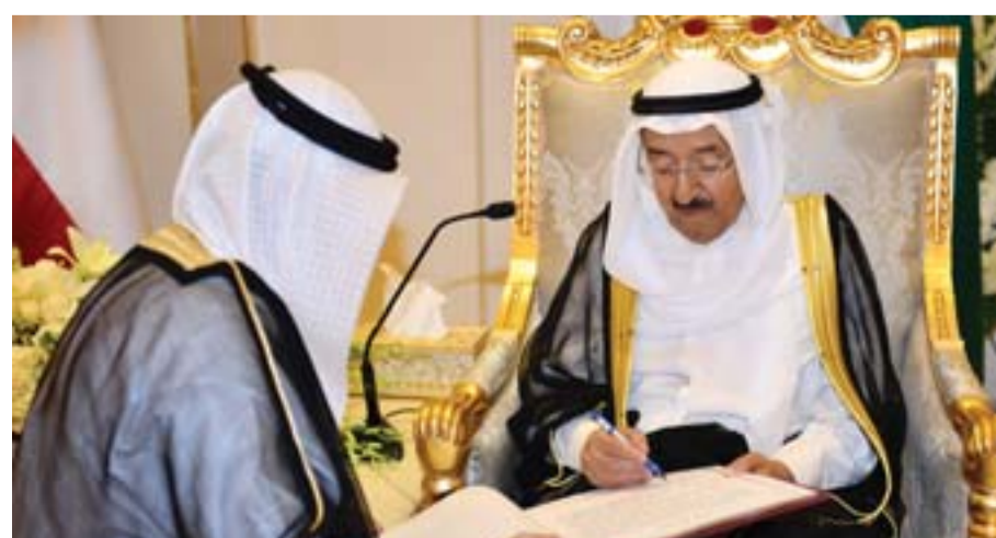
His Highness the Amir Sheikh Sabah Al-Ahmad Al-Jaber Al-Sabah signs the guestbook at the Kuwait Army Officers Club.