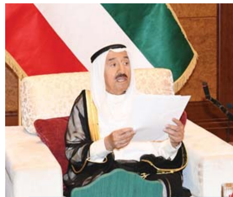
His Highness the Amir Sheikh Sabah Al-Ahmad Al-Jaber Al-Sabah delivers a speech at the Kuwait National Guard Presidency Headquarters.