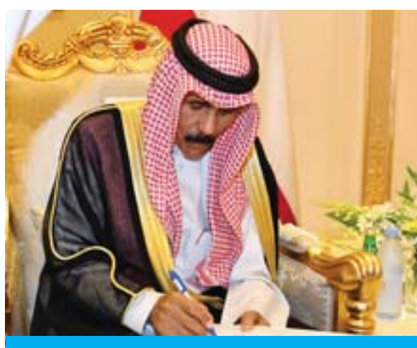
His Highness the Crown Prince Sheikh Nawaf Al-Ahmad Al-Jaber Al-Sabah signs the guestbook at the Kuwait Army Officers Club.