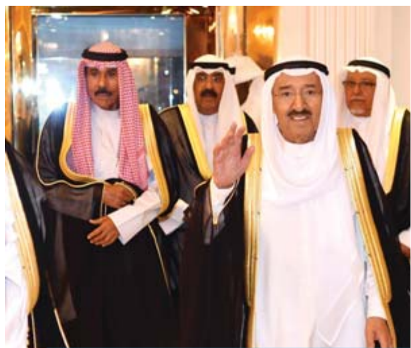
His Highness the Amir Sheikh Sabah Al-Ahmad Al-Jaber Al-Sabah greets officers and attendees at the Kuwait Army Officers Club.