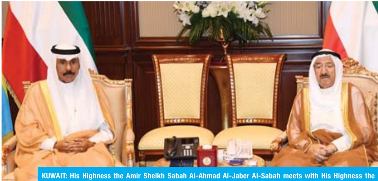
KUWAIT: His Highness the Amir Sheikh Sabah Al-Ahmad Al-Jaber Al-Sabah meets with His Highness the Crown Prince Sheikh Nawaf Al-Ahmad Al-Jaber Al-Sabah.