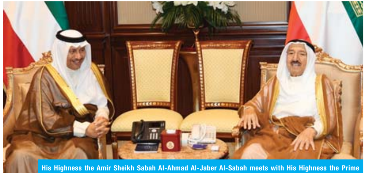
His Highness the Amir Sheikh Sabah Al-Ahmad Al-Jaber Al-Sabah meets with His Highness the Prime Minister Sheikh Jaber Al-Mubarak Al-Hamad Al-Sabah.

KUWAIT: His Highness the Amir Sheikh Sabah Al-Ahmad Al-Jaber Al-Sabah received yesterday at Bayan Palace His Highness the Crown Prince Sheikh Nawaf Al-Ahmad Al-Jaber Al-Sabah. His Highness also received His Highness the Prime Minister Sheikh Jaber Al-Mubarak Al-Hamad Al-Sabah. Meanwhile, His Highness