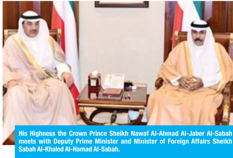
His Highness the Crown Prince Sheikh Nawaf Al-Ahmad Al-Jaber Al-Sabah meets with Deputy Prime Minister and Minister of Foreign Affairs Sheikh Sabah Al-Khaled Al-Hamad Al-Sabah.