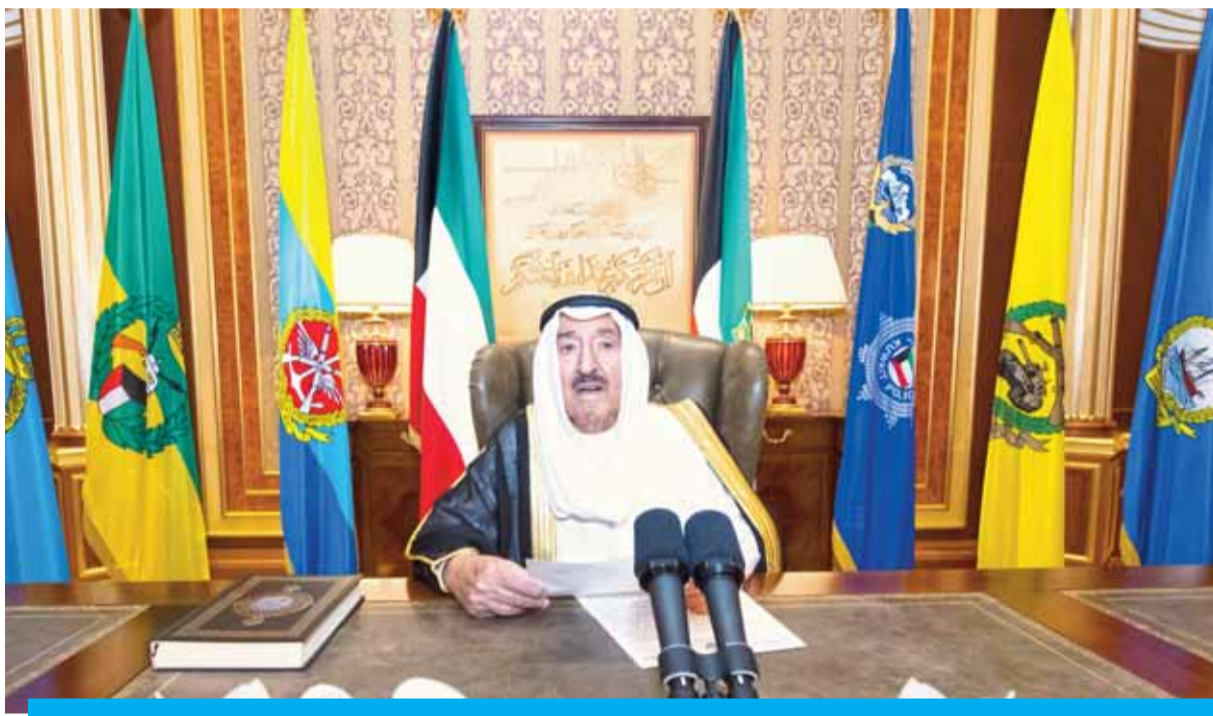
His Highness the Amir Sheikh Sabah Al-Ahmad Al-Jaber Al-Sabah

Media urged to play conscious and responsible role