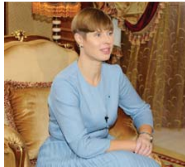
KUWAIT: The President of Estonia Kersti Kaljulaid.

"We've also signed a memorandum of understanding in digital development, and currently working on the agreement of multi-protection investment, which awaits an EU approval," added the Estonian President. "We are also moving forward with the avoidance of double-