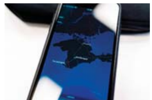
MOSCOW: An illustration picture taken yesterday shows an Apple map with the Crimea peninsula on a smartphone screen.

The Ukrainian Embassy in the United States tweeted: "We guess Ukrainians (are) not giving any thanks to @Apple this #Thanksgiving!" As of Wednesday, the Black Sea peninsula and its largest cities of Sevastopol and Simferopol were being displayed as Russian territory on Apple's apps when