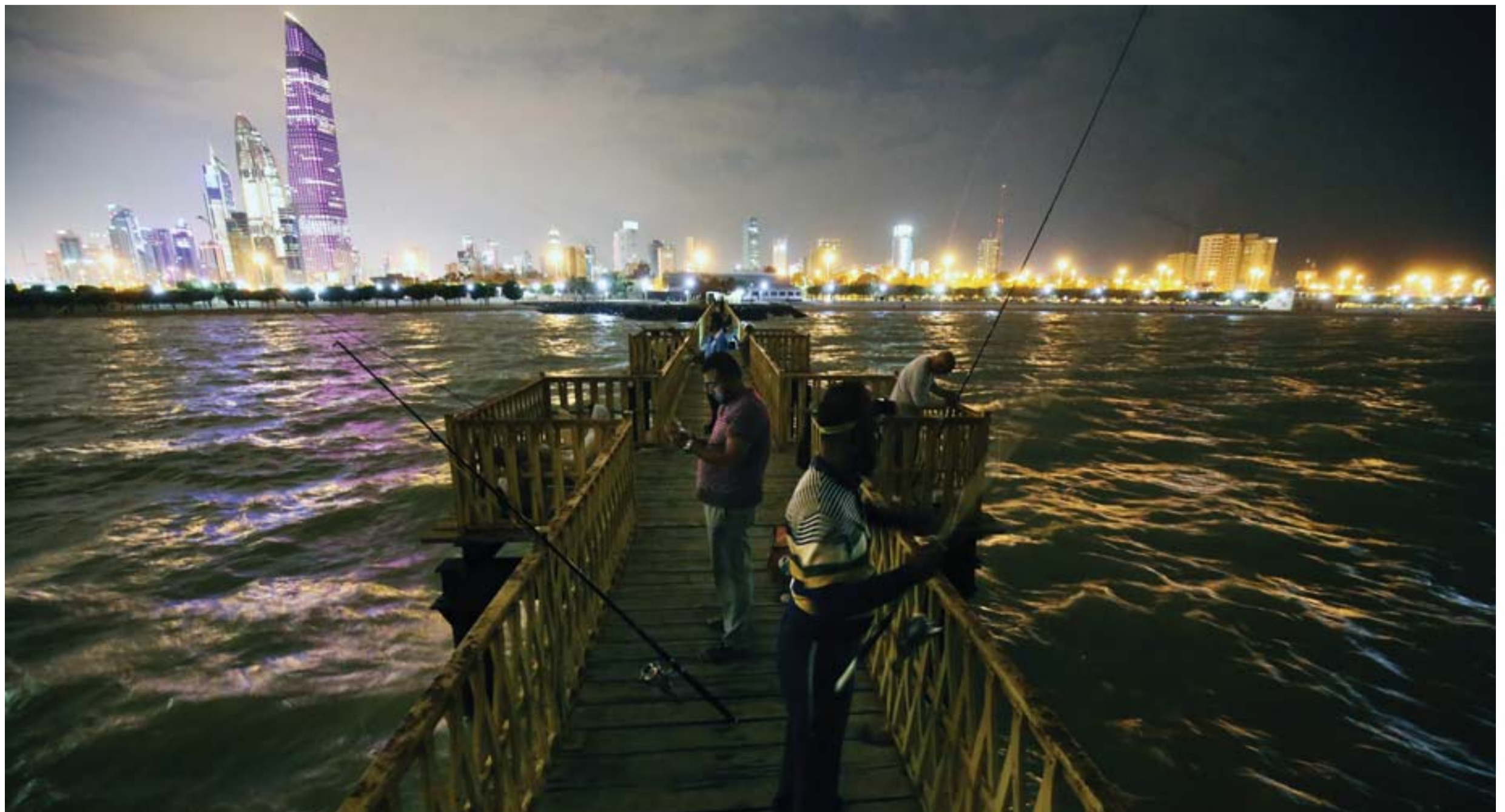
KUWAIT: Men cast their fishing rods on a pier in Kuwait City on October 27, 2019.