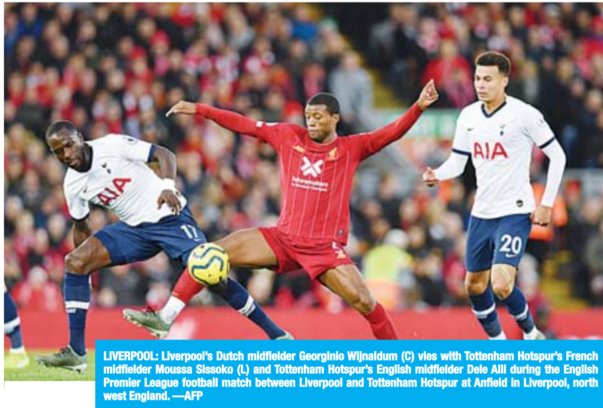
LIVERPOOL: Liverpool's Dutch midfielder Georginio Wijnaldum (C) vies with Tottenham Hotspur's French midfielder Moussa Sissoko (L) and Tottenham Hotspur's English midfielder Dele Alli during the English Premier League football match between Liverpool and Tottenham Hotspur at Anfield in Liverpool, north west England.

The South Korean's powerful strike from the edge