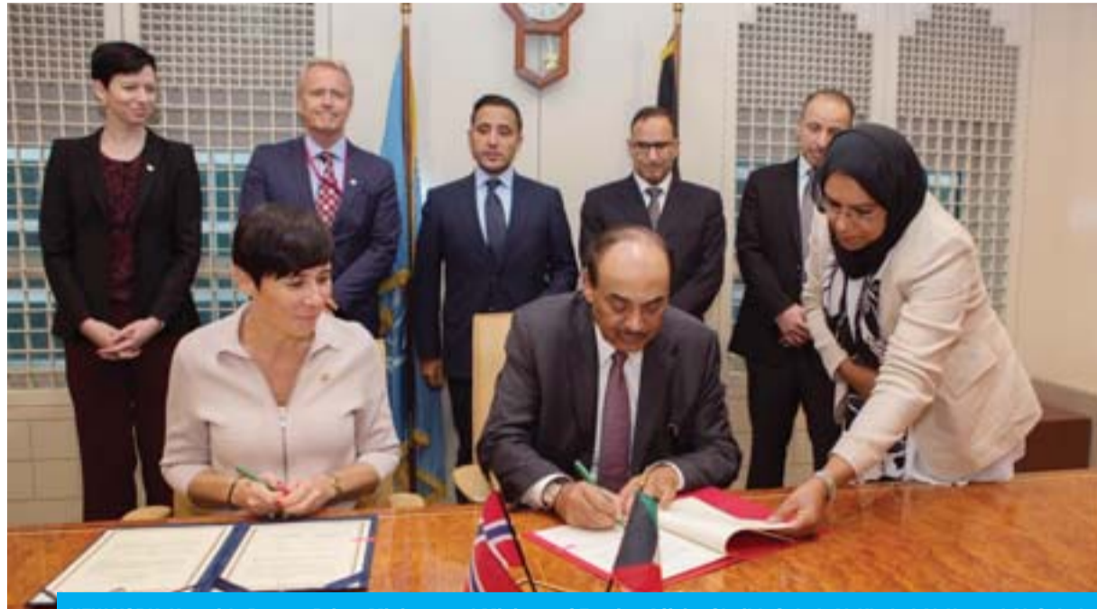
NEW YORK: Kuwait's Deputy Prime Minister and Minister of Foreign Affairs Sheikh Sabah Al-Khaled Al-Hamad Al-Sabah and Norway's Foreign Minister Ine Eriksen Soreide sign a memorandum of understanding between the two countries.

Sheikh Sabah Al-Khaled meets GCC counterparts ahead of UN General Assembly talks