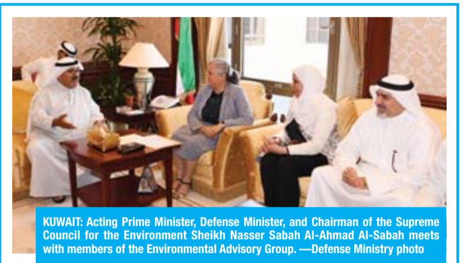
KUWAIT: Acting Prime Minister, Defense Minister, and Chairman of the Supreme Council for the Environment Sheikh Nasser Sabah Al-Ahmad Al-Sabah meets with members of the Environmental Advisory Group.

Jaber Al-Sabah to the Maltese President with wishes of good health, and more progress and prosperity for the people of Malta.