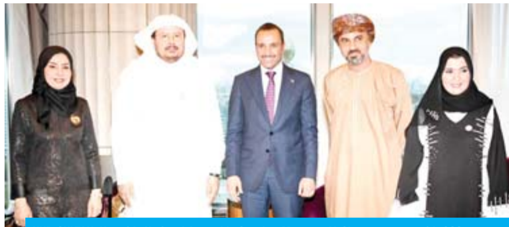
NUR-SULTAN: Kuwait's National Assembly Speaker Marzouq Al-Ghanem meets with GCC counterparts in Nur-Sultan, Kazakhstan.