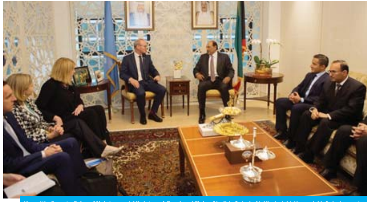
Kuwait's Deputy Prime Minister and Minister of Foreign Affairs Sheikh Sabah Al-Khaled Al-Hamad Al-Sabah meets with Foreign Minister of the Republic of Ireland Simon Coveney.

NEW YORK: Kuwait's Deputy Prime Minister and Minister of Foreign Affairs Sheikh Sabah Al-Khaled Al-Hamad Al-Sabah and Norway's Foreign Minister Ine Eriksen Soreide discussed issues of mutual concern and boosting ties. The meeting was held on the sidelines of the UN General Assembly's 74th session in New York late Sunday. The two sides also exchanged congratulations on receiving membership at the International Atomic Energy Agency's (IAEA) board of governors for the 2019-2021 term, for both countries. Moreover, they discussed boosting coordination for