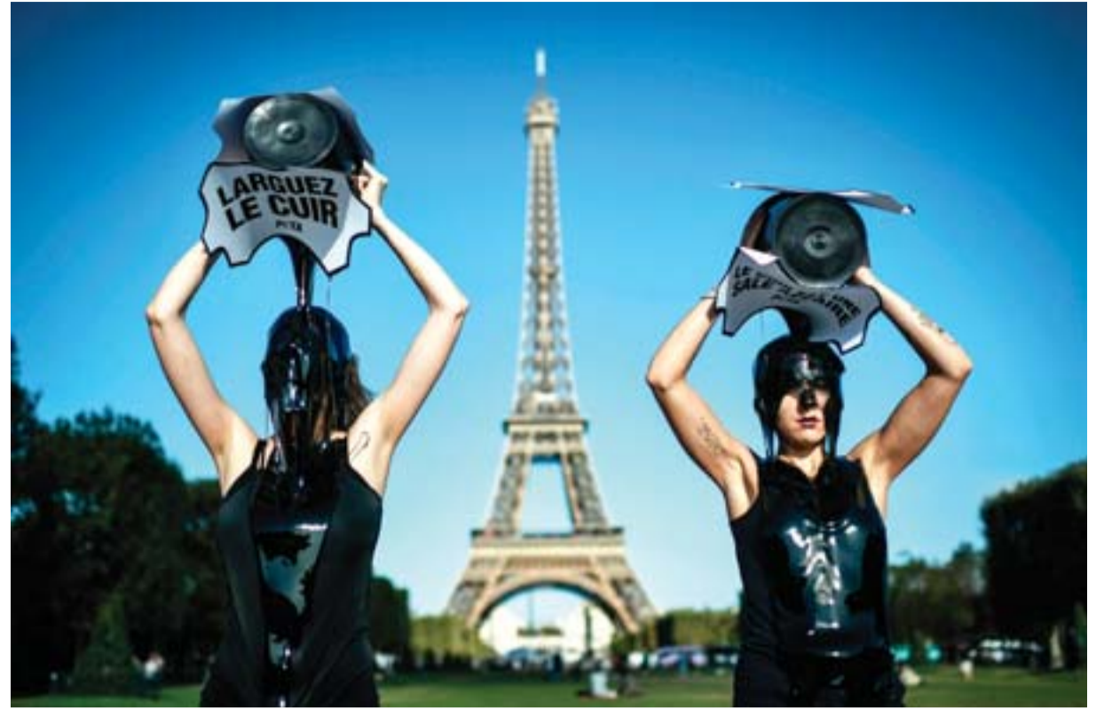
Activists for animal rights group People for the Ethical Treatment of Animal (PETA) douse themselves with black product during a protest against the use of leather in the fashion industry in front of the Eiffel tower in Paris.