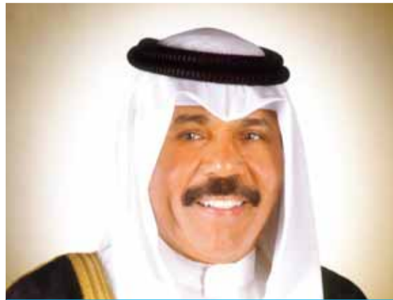
His Highness the Amir Sheikh Nawaf Al-Ahmad Al-Jaber Al-Sabah

An Amiri Decree was issued yesterday, calling on the newly elected National Assembly to hold the first regular session of the 16th legislative term on December 15. The Amiri Decree stipulated that it was issued in accordance with the Constitution, Decree 150/2020 that called on voters to elect members of the National Assembly and declaration of results of the general elections in all electoral districts held on December 5, 2020, and after a presentation by the Prime Minister and approval of the Cabinet. It has stipulated that the National Assembly is called upon