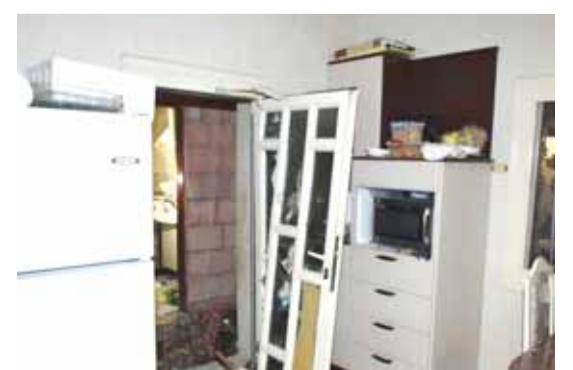
Heavy damage left by the gas cylinder explosion.