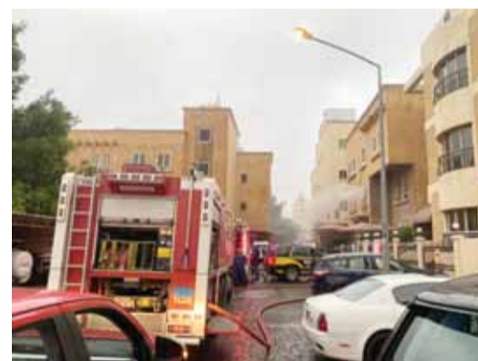
KUWAIT: Firemen battle the blaze in Jabriya.

P.O. Box 1301 Safat, 13014 Kuwait Tel: 24833199 - 24833358 - 24835616/7 | Fax: 24835620 - 24835621 E: info@kuwaittimes.net