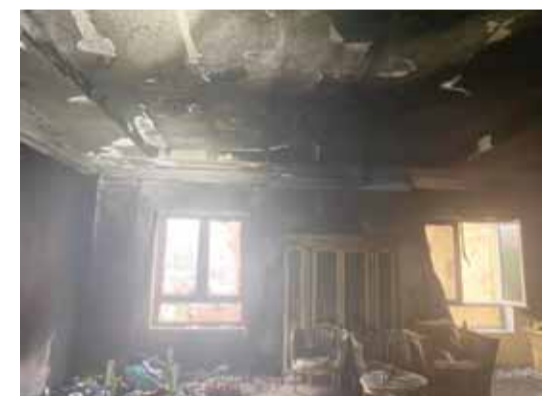
Heavy damage left by the fire in Jabriya.