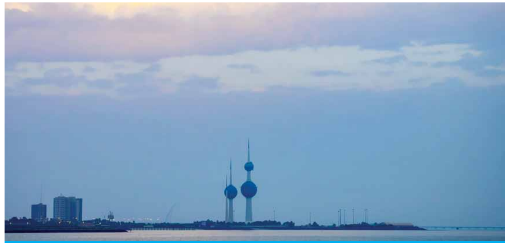
KUWAIT: Rain clouds hovering over Kuwait City.