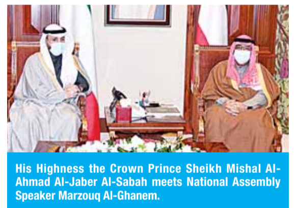
His Highness the Crown Prince Sheikh Mishal Al-Ahmad Al-Jaber Al-Sabah meets National Assembly Speaker Marzouq Al-Ghanem.