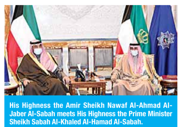
His Highness the Amir Sheikh Nawaf Al-Ahmad Al-Jaber Al-Sabah meets His Highness the Prime Minister Sheikh Sabah Al-Khaled Al-Hamad Al-Sabah.