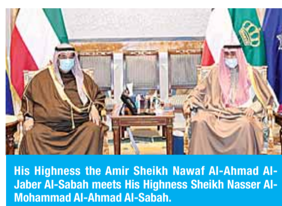
His Highness the Amir Sheikh Nawaf Al-Ahmad Al-Jaber Al-Sabah meets His Highness Sheikh Nasser Al-Mohammad Al-Ahmad Al-Sabah.

In other news, His Highness the Amir received at Bayan Palace yesterday His Highness the Crown Prince Sheikh Mishal, in addition to National Assembly Speaker Marzouq Al-Ghanem, His Highness Sheikh Nasser Al-Mohammad Al-Ahmad Al-Sabah and His Highness the Prime Minister Sheikh Sabah Al-Khaled Al-Hamad Al-Sabah. His Highness the Amir also received Deputy Prime Minister and Minister of State for Cabinet Affairs Anas Al-Saleh. Separately, His Highness the Crown Prince received Speaker Ghanem, His Highness Sheikh Nasser Al-Mohammad, His Highness Sheikh Sabah Al-Khaled and minister Saleh at Bayan Palace yesterday.