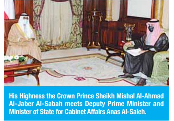
His Highness the Crown Prince Sheikh Mishal Al-Ahmad Al-Jaber Al-Sabah meets Deputy Prime Minister and Minister of State for Cabinet Affairs Anas Al-Saleh.