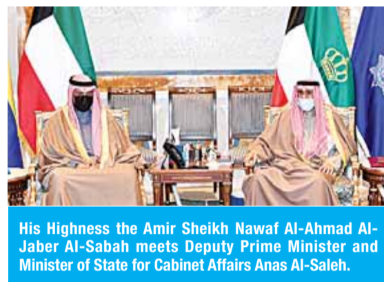
His Highness the Amir Sheikh Nawaf Al-Ahmad Al-Jaber Al-Sabah meets Deputy Prime Minister and Minister of State for Cabinet Affairs Anas Al-Saleh.