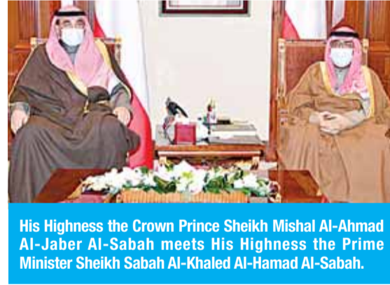
His Highness the Crown Prince Sheikh Mishal Al-Ahmad Al-Jaber Al-Sabah meets His Highness the Prime Minister Sheikh Sabah Al-Khaled Al-Hamad Al-Sabah.