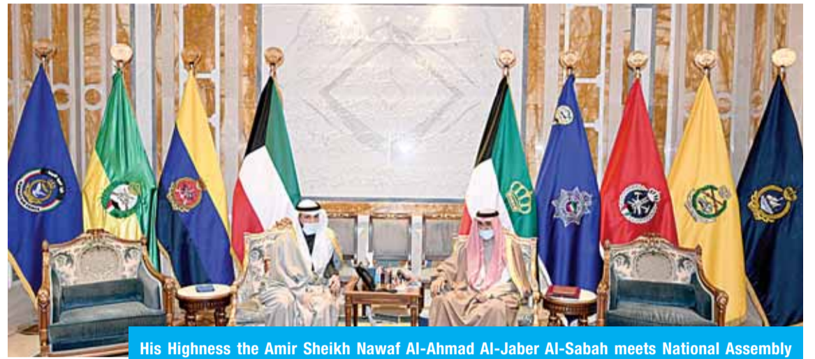
His Highness the Amir Sheikh Nawaf Al-Ahmad Al-Jaber Al-Sabah meets National Assembly Speaker Marzouq Al-Ghanem.

KUWAIT: His Highness the Amir Sheikh Nawaf Al-Ahmad Al-Jaber Al-Sabah received on Tuesday a phone call from Saudi King Salman bin Abdulaziz Al-Saud. During the call, the Saudi King congratulated His Highness the Amir on holding the first regular session of the 16th legislative term of the National Assembly, and the formation of the government. King Salman lauded His Highness the Amir's speech, wishing the new government success to achieve the aspirations of the Kuwaiti people, under the wise leadership of His Highness the Amir and His Highness the Crown Prince Sheikh Mishal Al-Ahmad Al-Jaber Al-Sabah. The Saudi leader touched upon the sisterly and historical distinguished ties between the two countries, looking forward to further progress and development of these relations. Meanwhile, His Highness the Amir expressed great gratitude to Saudi King Salman bin Abdulaziz for his call and sincere sentiments which embodied the bonds of deep-rooted and historical relations between the two countries and their nations. His Highness the Amir prayed to Allah Almighty to bestow everlasting wellness on Saudi King and wished Saudi Arabia further progress and prosperity under the King's wise leadership.