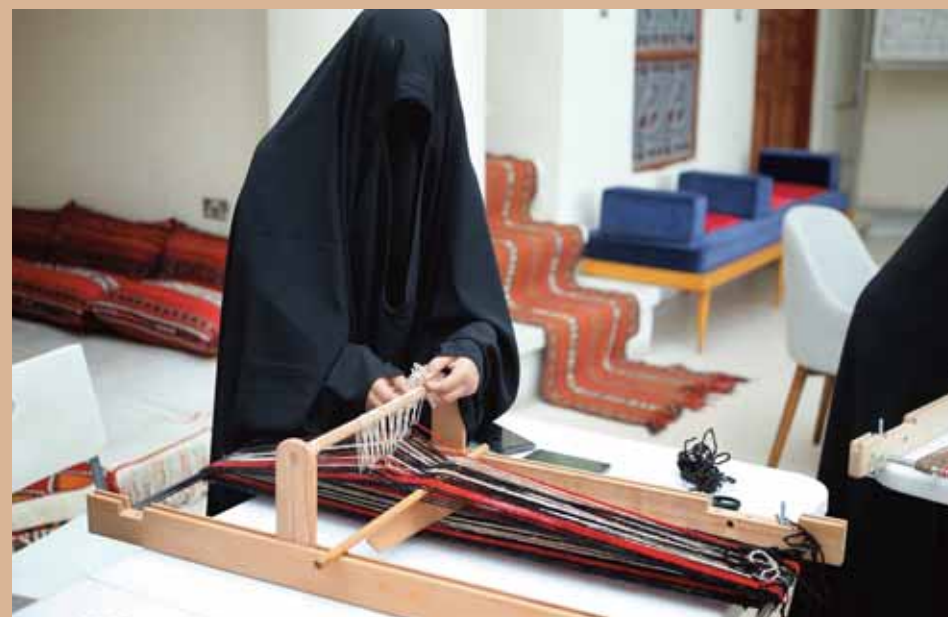
KUWAIT: Traditional Sadu weaving at Kuwait's Al-Sadu House.