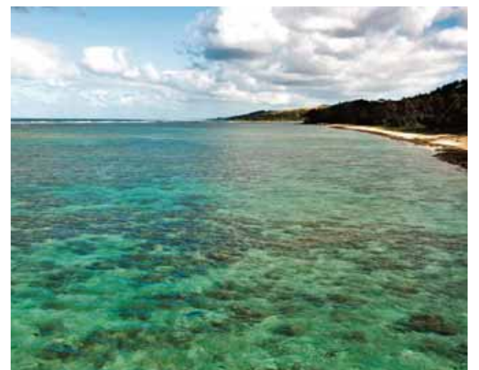
An aerial view of the Fiji's Coral Coast