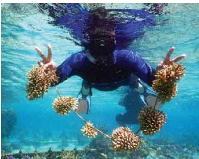
A diver swimming through the coral on Fiji's Coral Coast.