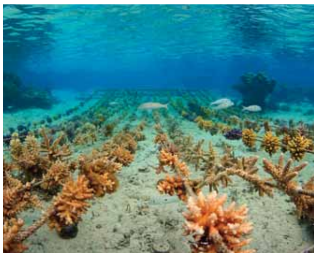
Fish swimming through the coral on Fiji's Coral Coast.