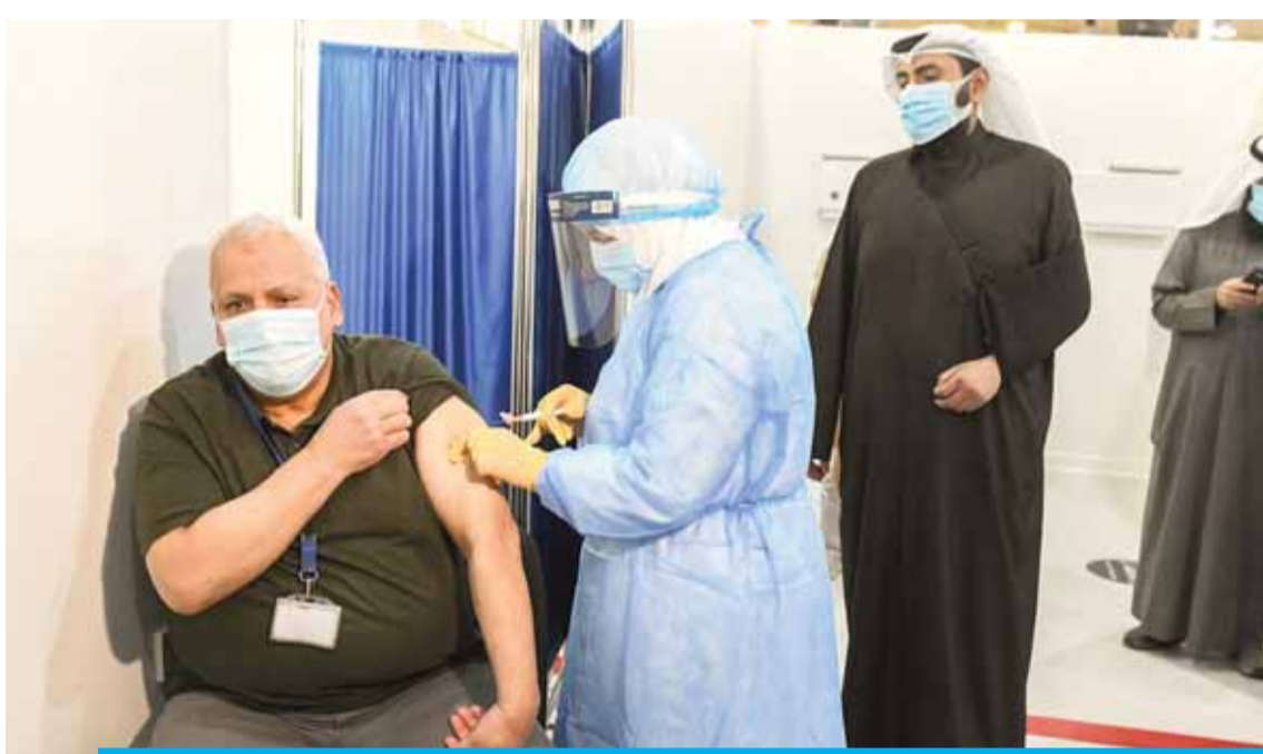
KUWAIT: Health Minister Sheikh Dr Basel Al-Sabah watches as a medic receives a dose of the Pfizer-BioTech COVID-19 vaccine at the vaccination center at the international fairgrounds in Mishref yesterday. (See Page 4)

Medical personnel will be the first to take the vaccine against COVID-19 throughout the week, Sheikh Basel affirmed. A shipment of vaccine doses will arrive in Kuwait every month and they will be provided to willing citizens and expatriates throughout 2021, he added. The minister called on everyone to register their names and other required data on the assigned website to get a date for immunization against COVID-19. He revealed none of those who had taken the vaccine suffered from side effects.