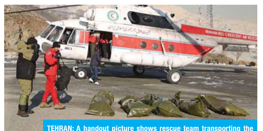
TEHRAN: A handout picture shows rescue team transporting the bodies of mountaineers who died after blizzards and avalanches hit mountains north of Tehran on Saturday. — AFP

Tehran lies at the foot of the Alborz mountain range which stretches across 900 km from the border with Azerbaijan in Iran's northwest to Khorasan province in the northeast. The area is famous for its many ski resorts and is popular with climbers. — AFP