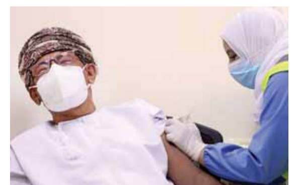
MUSCAT: Oman's Health Minister Ahmed Al-Saidi reacts as he receives his first dose of the vaccine yesterday. — AFP

Oman is hoping to quickly start receiving tourists, especially from its wealthy neighboring countries, to boost its economy that has been hit hard by slumping oil prices and the pandemic. — AFP