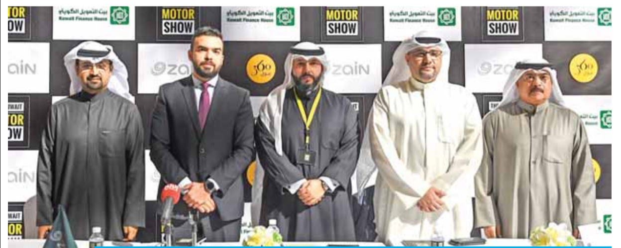
KUWAIT: A group picture taken during the press conference to announce the show.

Zain's support to this event comes in line with its core objectives that aim at shouldering the advancement of the community as a whole on all levels, where the company reaffirms the principal of partnership through similar efforts with the aim of contributing to the further progress of national economy.