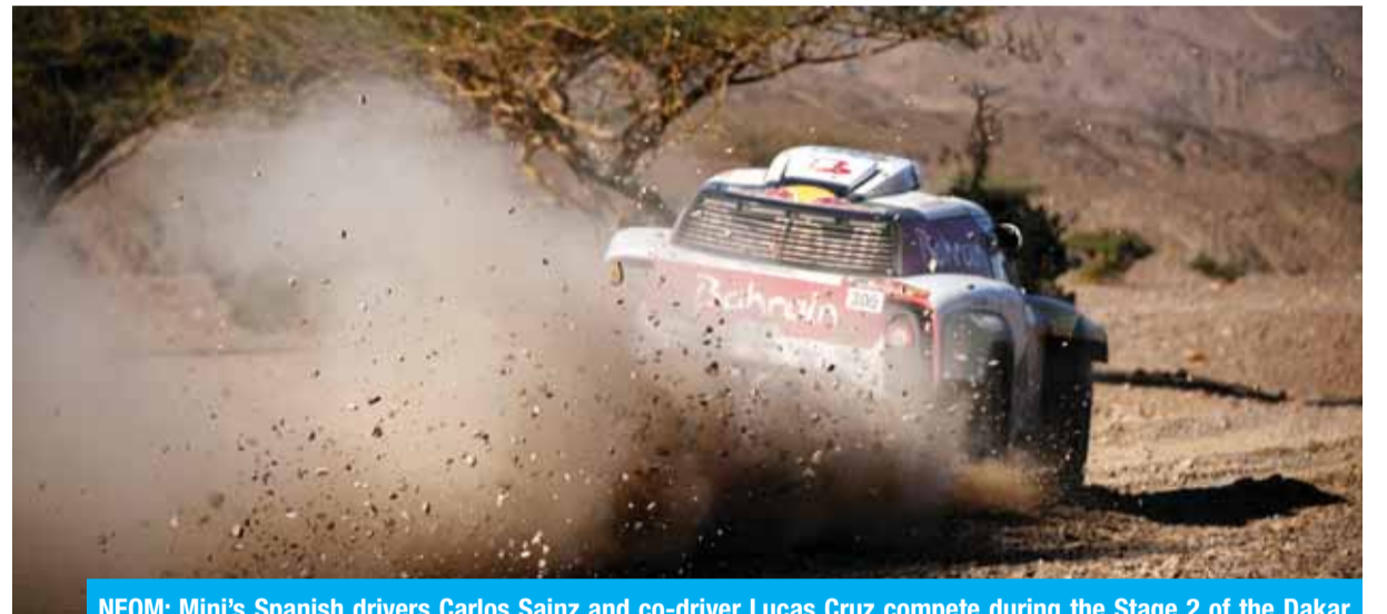
NEOM: Mini's Spanish drivers Carlos Sainz and co-driver Lucas Cruz compete during the Stage 2 of the Dakar 2020 between Al Wajh and Neom, Saudi Arabia, yesterday.