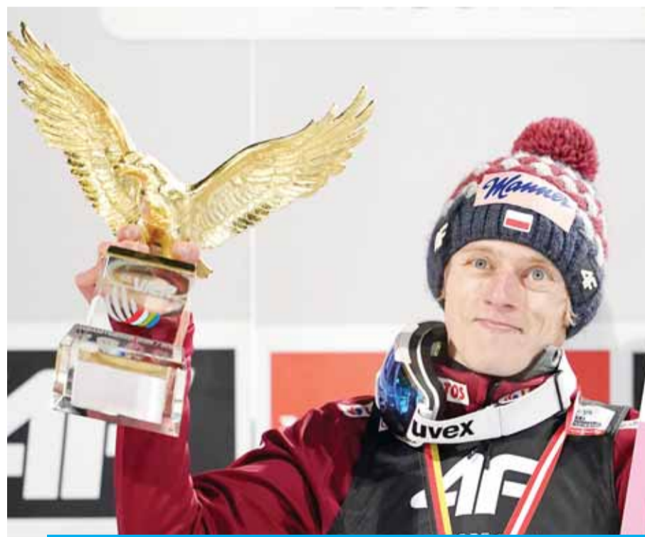
BISCHOFSHOFEN: Dawid Kubacki from Poland celebrates with the trophy of the Four-Hills Ski Jumping tournament (Vierschanzentournee), in Bischofshofen, Austria, yesterday. — AFP

1. Dawid Kubacki (POL) 1,131.6 points, 2. Marius Lindvik (NOR) 1,111, 3. Karl Geiger (GER) 1,108.4, 4. Ryoyu Kobayashi (JPN) 1,096. — AFP