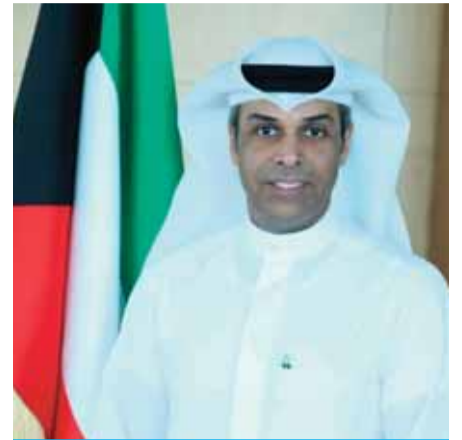
Kuwait's Oil Minister and Acting Minister of Electricity and Water Dr Khaled Al-Fadhel.

Earlier, Iraq's parliament approved the remainder of Prime Minister Mustafa Al-Kadhimi's cabinet and passing the candidates for seven government posts. A total of 247 MPs approved the seven ministry posts that had remained vacant since Kadhimi was sworn in last month. The new posts include oil, trade, foreign affairs, justice, migration and displacement and culture and agriculture ministries, completing the premier's 22-member cabinet. — KUNA