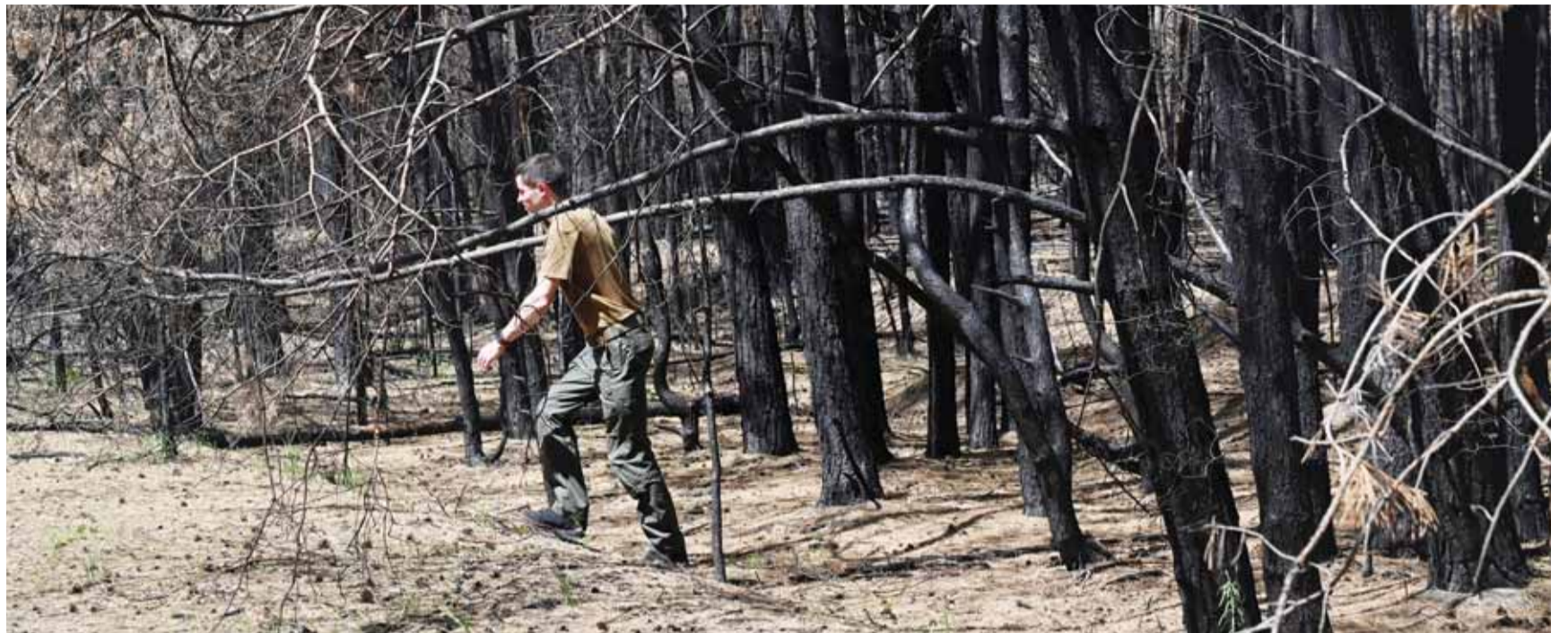
An employee walks through coalfield trees in a burnt forest near the village of Ilovnytsya in the Chernobyl thirty-kilometer zone on Friday.