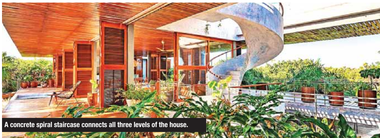
A concrete spiral staircase connects all three levels of the house.

Because of its protected location in Yucatan's Sian Ka'an Biosphere Reserve, planning restrictions meant that the villa could only measure 300 square-metres and be eight metres in height, keeping it low in its jungle surroundings. The reserve is home to spider and howler monkeys, American crocodiles, Central American tapirs and hundreds of types of birds.