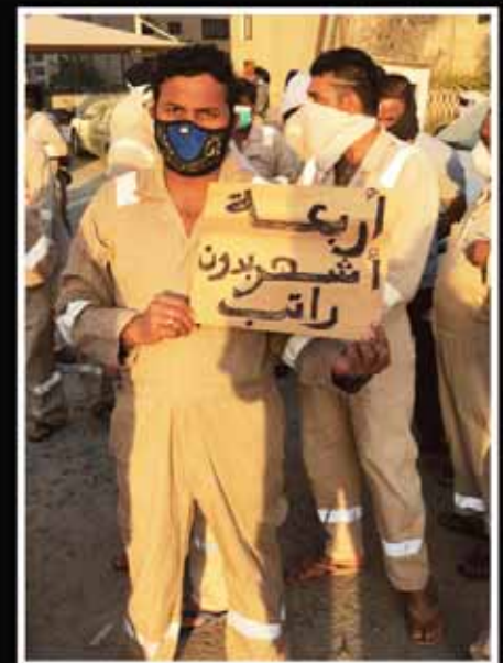
KUWAIT: These photos provided by a representative of the protesting workers show them holding signs demanding justice during a peaceful sit-in outside their building on Wednesday.