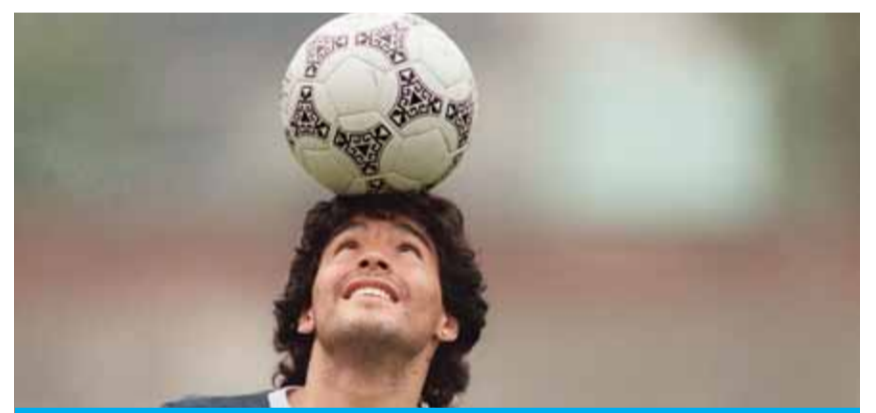
MEXICO CITY: In this file photo taken on May 22, 1986, Argentine football star Diego Maradona balances a ball on his head as he walks off the practice field.

Biden's remarks came after Trump suffered further setbacks in his efforts. Continued on Page 2