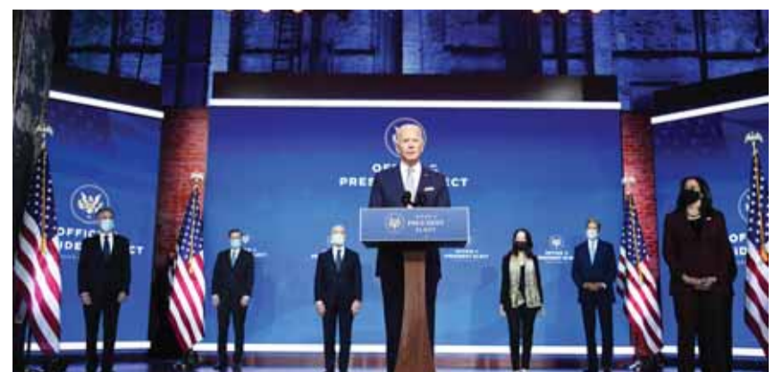
WILMINGTON: US President-elect Joe Biden speaks during a cabinet announcement event yesterday.