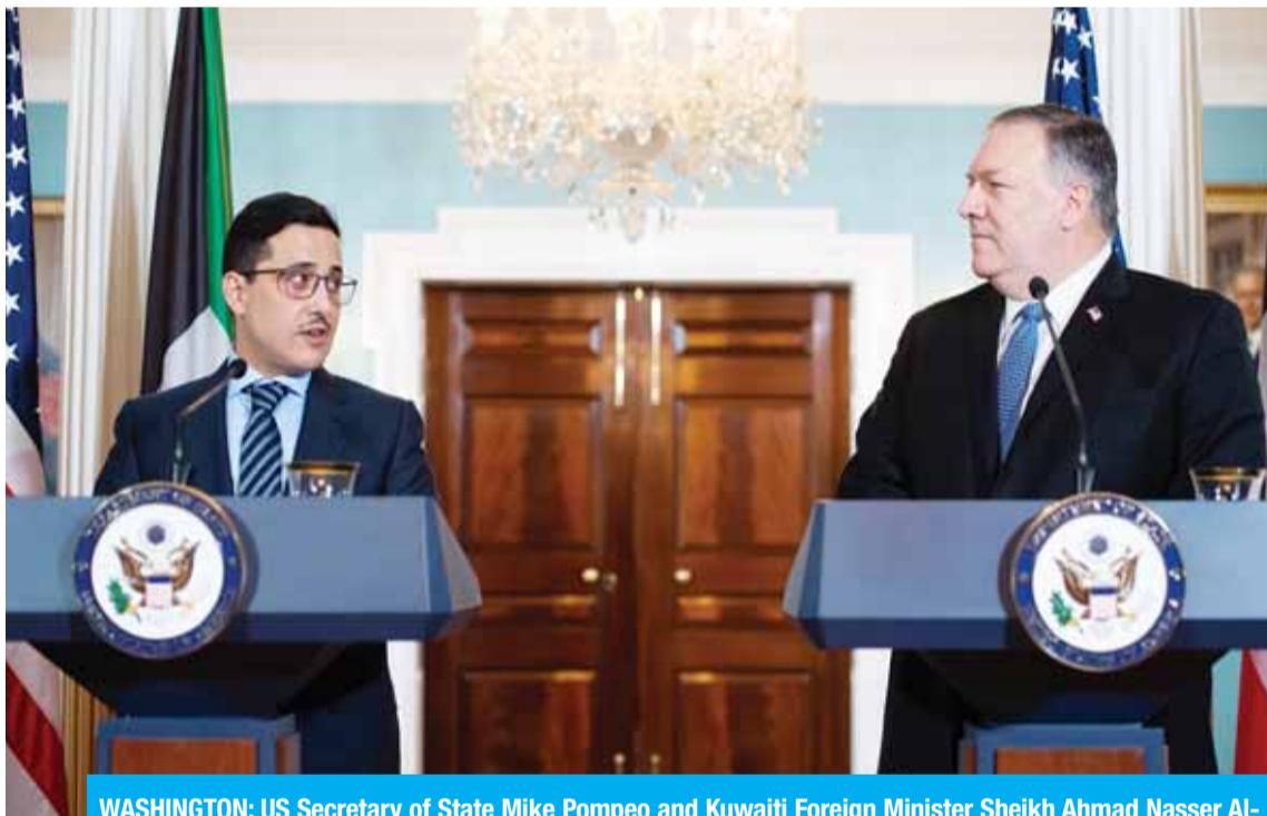
WASHINGTON: US Secretary of State Mike Pompeo and Kuwaiti Foreign Minister Sheikh Ahmad Nasser Al-Mohammad Al-Sabah speak to the media prior to meeting at the State Department on Tuesday.

Pompeo hails Kuwait as a key strategic partner of US in Middle East