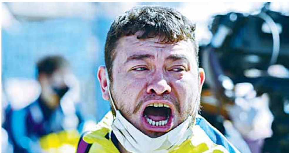
Buenos Aires: A fan mourns outside the Casa Rosada government house as he waits to pay tribute to Argentinean late football legend Diego Armando Maradona in Buenos Aires yesterday.

Buenos Aires: Fans worldwide paid tribute and Argentina was in mourning yesterday after Diego Maradona, one of the greatest footballers of all time, died aged 60 after years of drug and alcohol problems. Thousands of mourners, many in tears, and many wearing the World Cup winner's number 10 Argentina jersey, gathered in streets and at stadiums around Buenos Aires in a spontaneous celebration of the player and manager's riotous life.