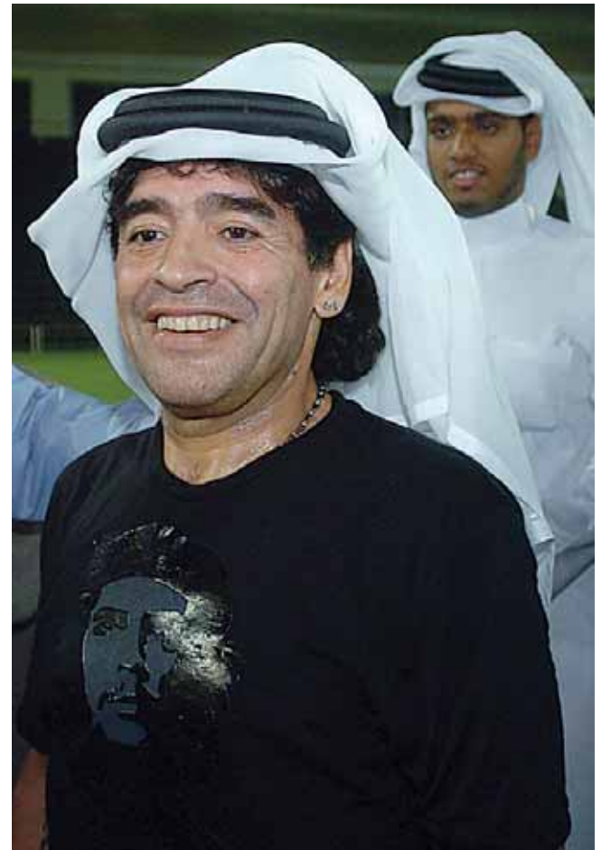
DOHA: In this file photo, Argentina's 1986 World Cup winning hero Diego Maradona wearing a traditional Arab headdress visits Al-Sadd club in Doha.