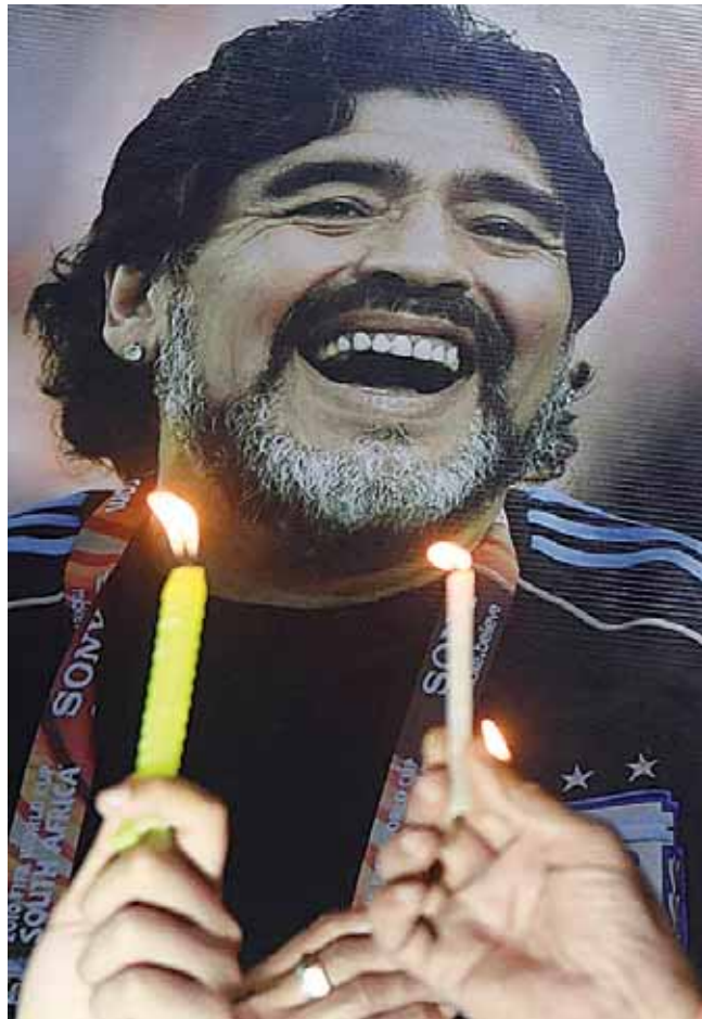
KOLKATA: Fans hold candles as they pay homage to late Argentinian football legend Diego Armando Maradona in Kolkata yesterday.