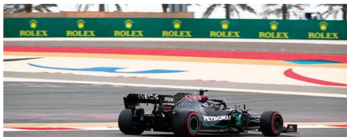
SAKHIR: Mercedes' British driver Lewis Hamilton drives during the third practice session on the eve of the Bahrain Formula One Grand Prix at the Bahrain International Circuit in the city of Sakhir yesterday.

"I'm really trying very hard not to say anything," he responded when asked about the tyres. "But they are three kilos heavier and like a second a lap slower." Hamilton prefaced his comments with respect and praise for the role of the Italian tyre suppliers in F1 before he gave vent to his feelings, as shared by many other drivers. "Weekend in and weekend out, every year, we've got a team here from Pirelli and I have the utmost respect for the guys who come here and load our tyres up, bring them here and keep us safe - they do an amazing job. —AFP