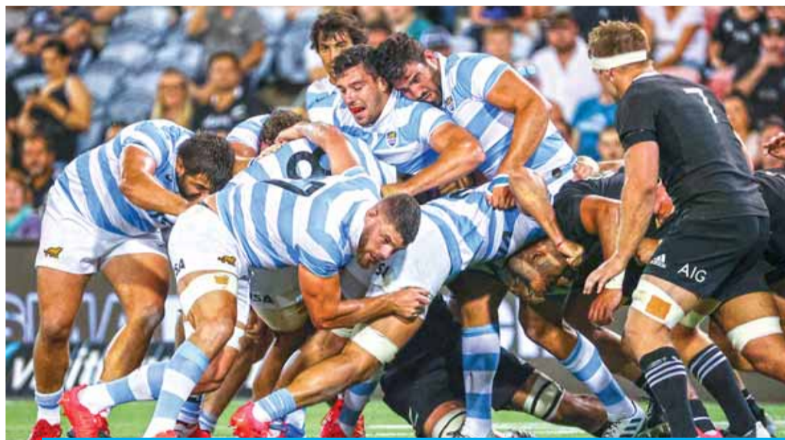
NEWCASTLE: Argentina players push against New Zealand players in a maul during the 2020 Tri-Nations rugby match between New Zealand and Argentina at the McDonald Jones Stadium in Newcastle yesterday.

dling errors when we got the ball, some mistakes in defense as well, so not a good thing for us," said Pumas skipper Pablo Matera. "I don't think that was the problem," he added, when asked about the team's wholesale changes. "It was a whole team thing. There were many, many mistakes." Victory eased the pressure on Foster, who had been facing calls for his axing after just five games in charge following their twin defeats. He shuffled his forward pack to better deal with Argentina's physicality and they responded well. —AFP