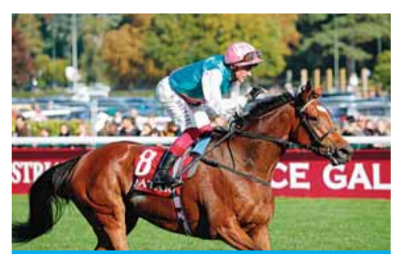
PARIS: Italian jockey Frankie Dettori riding horse 'Enable' - reacts after finishing second during the 2019 Prix de l'Arc de Triomphe flat race at the ParisLongchamp race track in Paris.

Davis is averaging 33 points and 11.5 rebounds