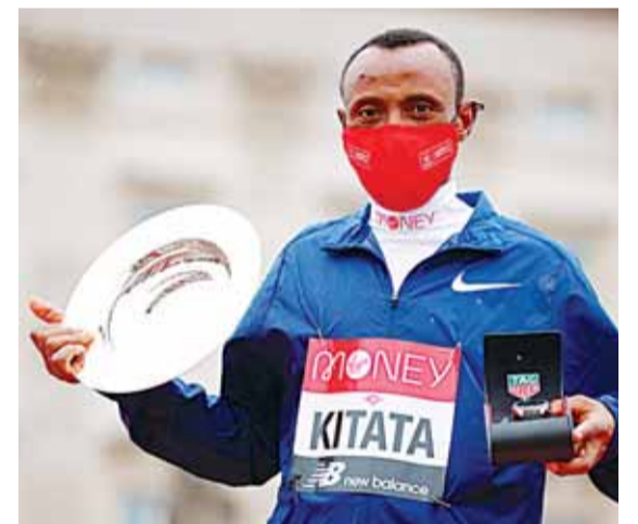
LONDON: Winner, Ethiopia's Shura Kitata poses with his trophy in front of Buckingham Palace after the elite men's race of the 2020 London Marathon in central London yesterday.

Earlier, Kenyan world record holder Brigid Kosgei was a comfortable winner of the women's race in 2:18.58 as American Sara Hall produced a great finish to snatch second from Ruth Chepngetich. The races, originally postponed from April because of the COVID-19 pandemic, were run over almost 20 laps of a fenced-off course in a "controlled secure biosphere" around St James's Park. Although there was no mass field this year, around 40,000 people are running the distance at venues of their choice through the day. They will receive official finisher's medals and raise millions of pounds for charities hard hit by the cancellation of the April race. —Reuters