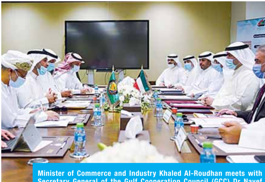
Minister of Commerce and Industry Khaled Al-Roudhan meets with Secretary General of the Gulf Cooperation Council (GCC) Dr Nayef Al-Hajraf.

KUWAIT: Foreign Minister and Acting Defense Minister Sheikh Dr Ahmad Nasser Al-Mohammad Al-Sabah received Bahrain's Ambassador to Kuwait Salah Al-Malki at his office yesterday. Assistant Foreign Minister for GCC Affairs Nasser Al-Muzayyen and Assistant Foreign Minister for the Office of Foreign Minister Saleh Al-Loughani attended the meeting, the ministry said in a statement. In the meantime, Minister of Commerce and Industry Khaled Al-Roudhan and Secretary General of the Gulf Cooperation Council (GCC) Dr Nayef Al-Hajraf discussed boosting cooperation between Gulf states on Sunday. The meeting also discussed joint GCC economic efforts in light of the novel coronavirus (COVID-19) crisis, the Ministry of Commerce and Industry said in a statement. Moreover, they discussed a patent protecting local