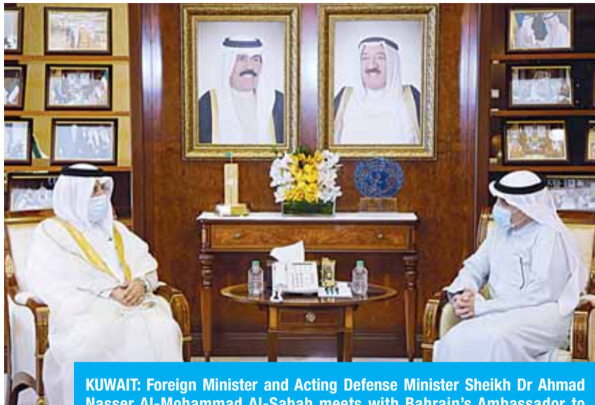
KUWAIT: Foreign Minister and Acting Defense Minister Sheikh Dr Ahmad Nasser Al-Mohammad Al-Sabah meets with Bahrain's Ambassador to Kuwait Salah Al-Malki.

Kuwait, GCC discuss boosting cooperation among members