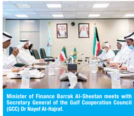
Minister of Finance Barrak Al-Sheetan meets with Secretary General of the Gulf Cooperation Council (GCC) Dr Nayef Al-Hajraf.

distributors and tackling issues facing the GCC countries in the commerce field. Senior state officials representing different state institutions attended the meeting. Meanwhile, Minister of Finance Barrak Al-Sheetan discussed with Dr Hajraf economic issues facing the Gulf states on Sunday. The two sides also discussed means of tackling economic difficulties caused by the coronavirus crisis, the Ministry of Finance said in a statement. The talks also dealt with boosting the work system of the GCC Customs Union, patent rights, as well as enhancing development and economic activities. GCC General Secretariat's assistant secretary for economic and developmental affairs Khalifa Al-Abri and a number of senior GCC and Finance Ministry officials attended the meeting. —KUNA