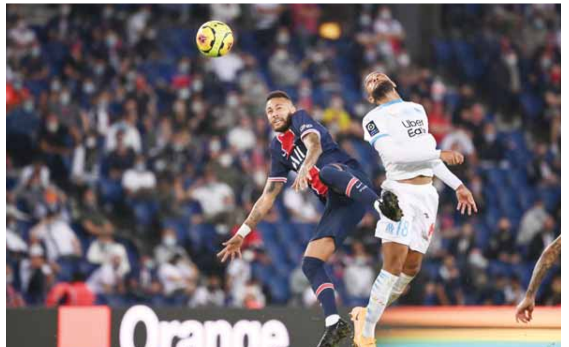
PARIS: Marseille's French defender Jordan Amavi (right) and Paris Saint-Germain's Brazilian forward Neymar jump for the ball during the French L1 football match between Paris Saint-Germain (PSG) and Marseille (OM) on September 13, 2020.

Di Maria found the net for PSG just past the hour but had strayed clearly behind the last defender, and Marseille's celebrations were cut short in similar fashion moments later when a Benedetto goal was ruled offside. The Argentine rifled in a rebound after Rico parried from Thauvin, who was controversially adjudged to be in an offside position much to the frustration of Marseille. PSG's last goal came in the 3-0 win over RB Leipzig in the Champions League semi-final on August 18, and Neymar poked wide from a Pablo Sarabia cross before the contest turned ugly at the finish.