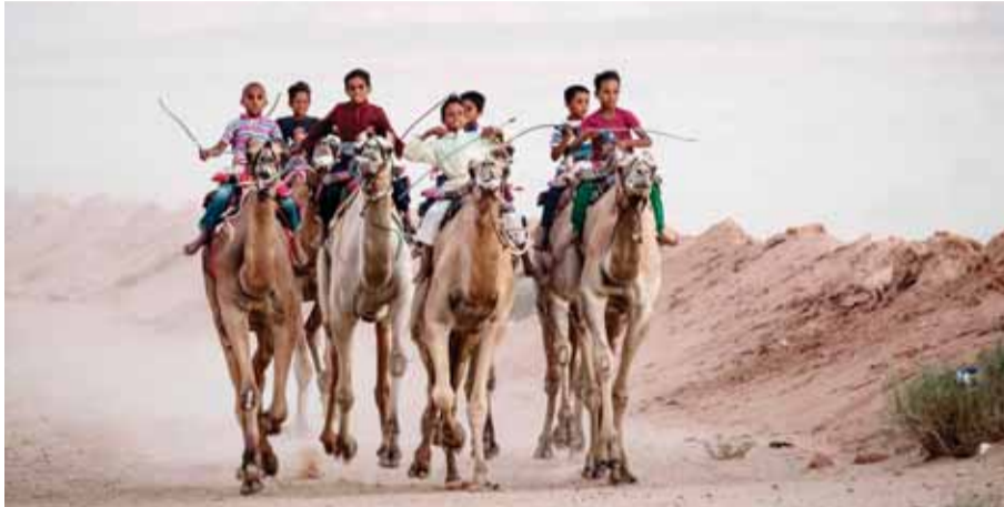
SOUTH SINAI, Egypt: Camels carrying jockeys on their backs, run on a dirt track during a race in Egypt's South Sinai desert, after more than six months of hiatus due to the coronavirus outbreak.

One group of camels after another, placed in different categories according to age and whether they were male or female, made their debut on the dirt track lined by sand embankments on each side. On their backs sat mechanical jockeys wearing racing jerseys and brandishing whips, which are lighter than human riders.