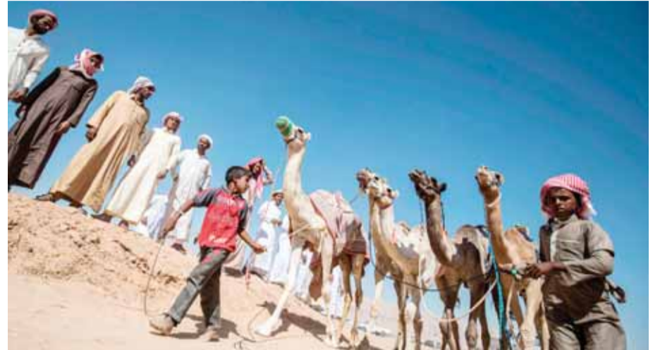
SOUTH SINAI: Bedouins prepare camels before they take part in a race in Egypt's South Sinai desert.

In a different race, young boys mount the camels to complete a 10-kilometre course.