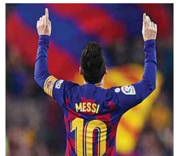
Barcelona's Argentinean forward Lionel Messi

PARIS: Lionel Messi may have had to stay put at Barcelona but the Argentine legend did succeed in joining one new club this year—the one reserved for sporting billionaires, according to Forbes magazine. The Argentine striker's career earnings of over one billion dollars (840 million euros) places the six-time Ballon d'Or winner in a group of mega-wealthy sports figures containing just Tiger Woods, Floyd Mayweather and his great rival on the pitch, Cristiano Ronaldo.