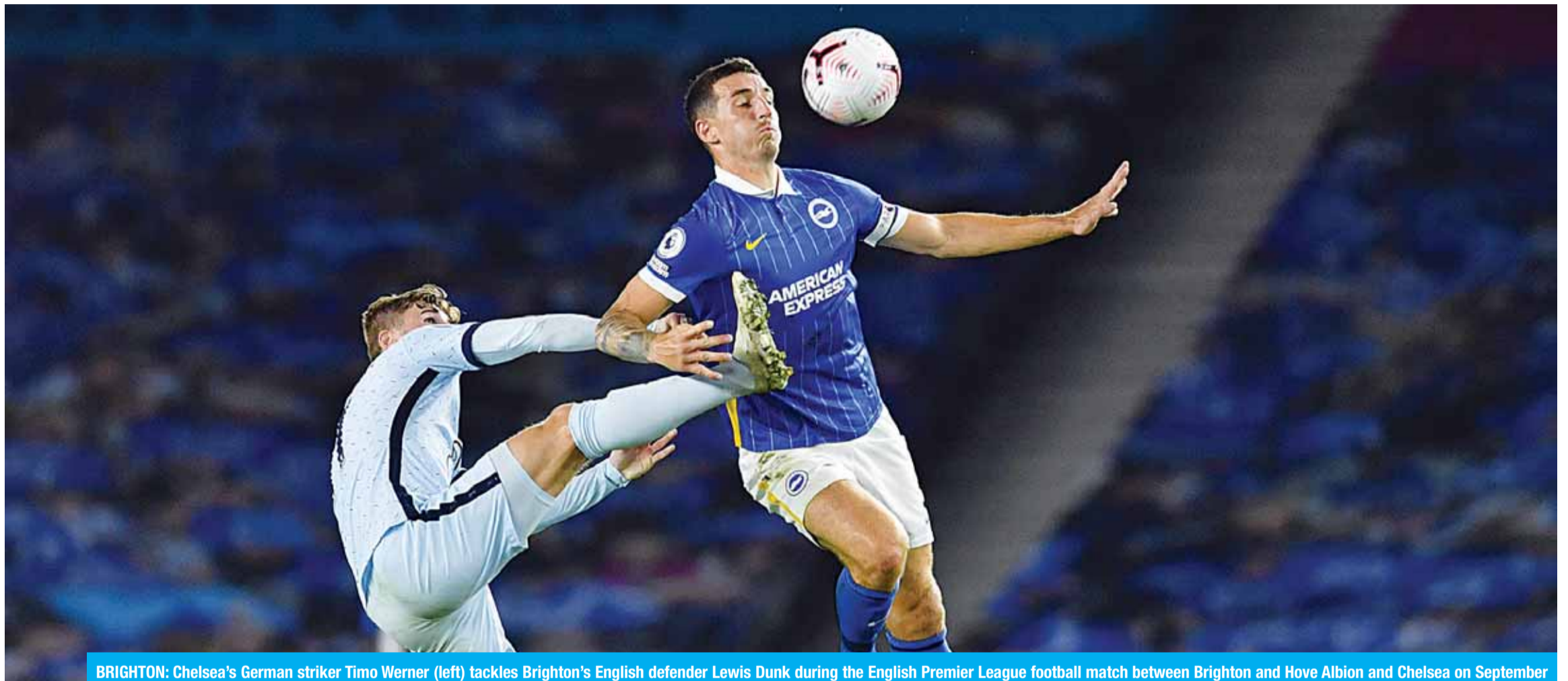
BRIGHTON: Chelsea's German striker Timo Werner (left) tackles Brighton's English defender Lewis Dunk during the English Premier League football match between Brighton and Hove Albion and Chelsea on September 14, 2020.