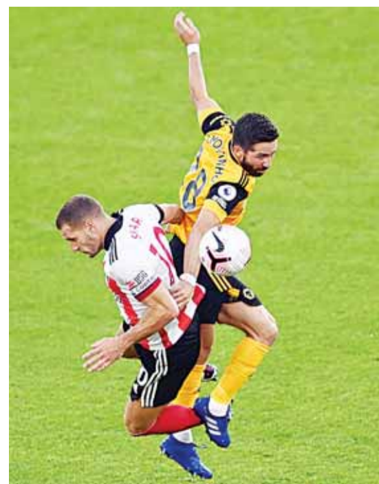
SHEFFIELD: Wolverhampton Wanderers' Portuguese midfielder Joao Moutinho (right) jumps to head the ball against Sheffield United's English striker Billy Sharp during the English Premier League football match between Sheffield United and Wolverhampton Wanderers on September 14, 2020.

In his 100th game in all competitions for Wolves, the prolific Jimenez was proving impossible to contain and he was close to his 32nd Premier League goal when he curled just over. After bullying most opponents at home last season, United were well off the pace and it was almost half-time before Wolves keeper Rui Patrício had to make a save from Oli McBurnie. John Fleck almost reduced the deficit early in the second half when his shot cannoned off the post before George Baldock's follow-up deflected wide. Those near misses could not revive United and Wolves finished on top as Saiss and Jimenez both hit the woodwork.