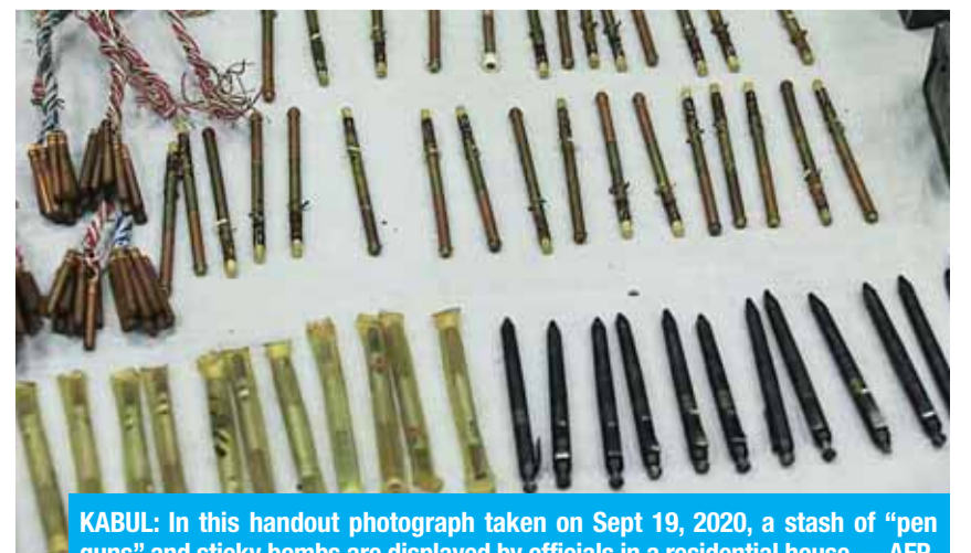
KABUL: In this handout photograph taken on Sept 19, 2020, a stash of "pen guns" and sticky bombs are displayed by officials in a residential house. — AFP

Rising unemployment and poverty have worsened Kabul's already abysmal security situation, with kidnappings, robberies and drive-by shootings commonplace. — AFP