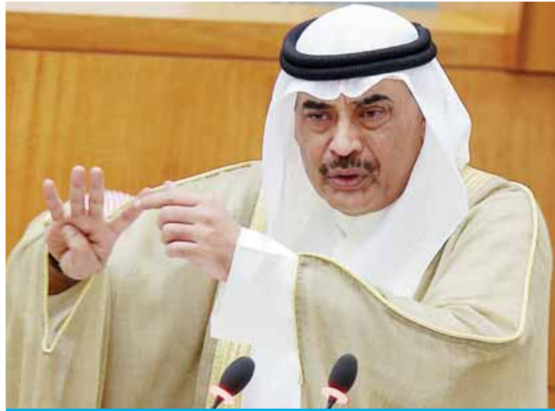
KUWAIT: HH the Prime Minister Sheikh Sabah Al-Khaled Al-Sabah speaks during a grilling session at the National Assembly yesterday.