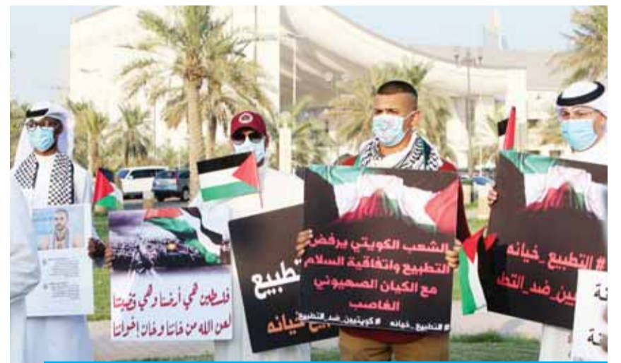
KUWAIT: Kuwaiti citizens hold a demonstration in Irada Square opposite the National Assembly yesterday to express their rejection of any normalization of ties with Israel.