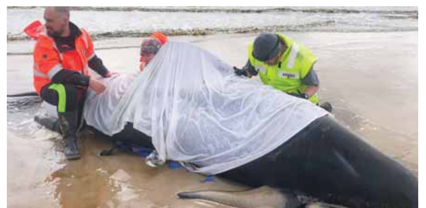
MACQUARIE HARBOR: A handout photo taken on Tuesday shows people helping a whale on the rugged west coast of Tasmania.