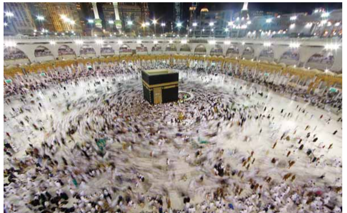
MAKKAH: In this file photo taken on June 14, 2018, worshippers and pilgrims gather at the Grand Mosque.