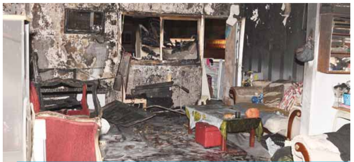
KUWAIT: Heavy damage left by a fire reported in a Sabah Al-Salem building yesterday.

Kuwait Times ESTABLISHED 1961 THE FIRST DAILY IN THE ARABIAN GULF