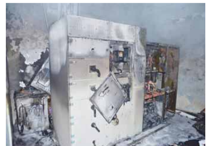
A power transformer in Hawally seen after firemen put out a blaze reported there yesterday.

KUWAIT: Firemen battled a blaze reported in a Sabah Al-Salem building yesterday. Mishref and Qurain fire stations' men arrived to the scene shortly after the blaze was reported, and immediately evacuated the three-storey building before tackling the flames. Four persons suffered smoke inhalation and were treated on site, Kuwait Fire Service Directorate (KFS) said in a statement. Meanwhile, Hawally firemen put out a blaze that started in a power transformer in the area yesterday, KFS said, adding that no injuries were reported. Investigations were opened in both cases.