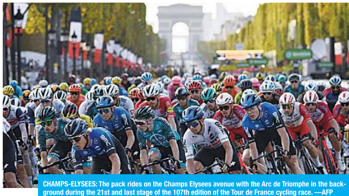
CHAMPS-ELYSEES: The pack rides on the Champs Elysees avenue with the Arc de Triomphe in the background during the 21st and last stage of the 107th edition of the Tour de France cycling race.