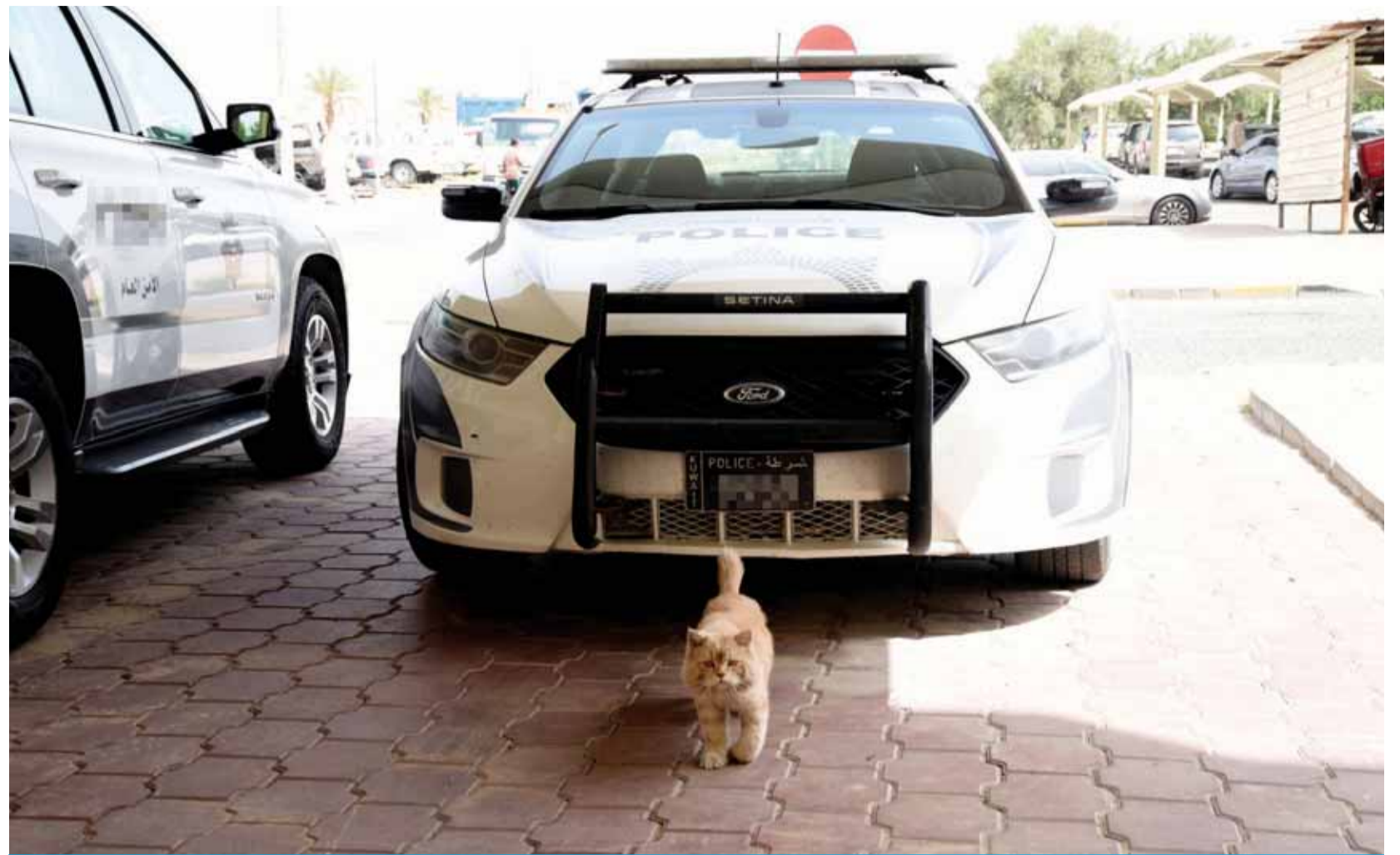
KUWAIT: A cat walks in front of a patrol vehicle outside a police station in Kuwait.