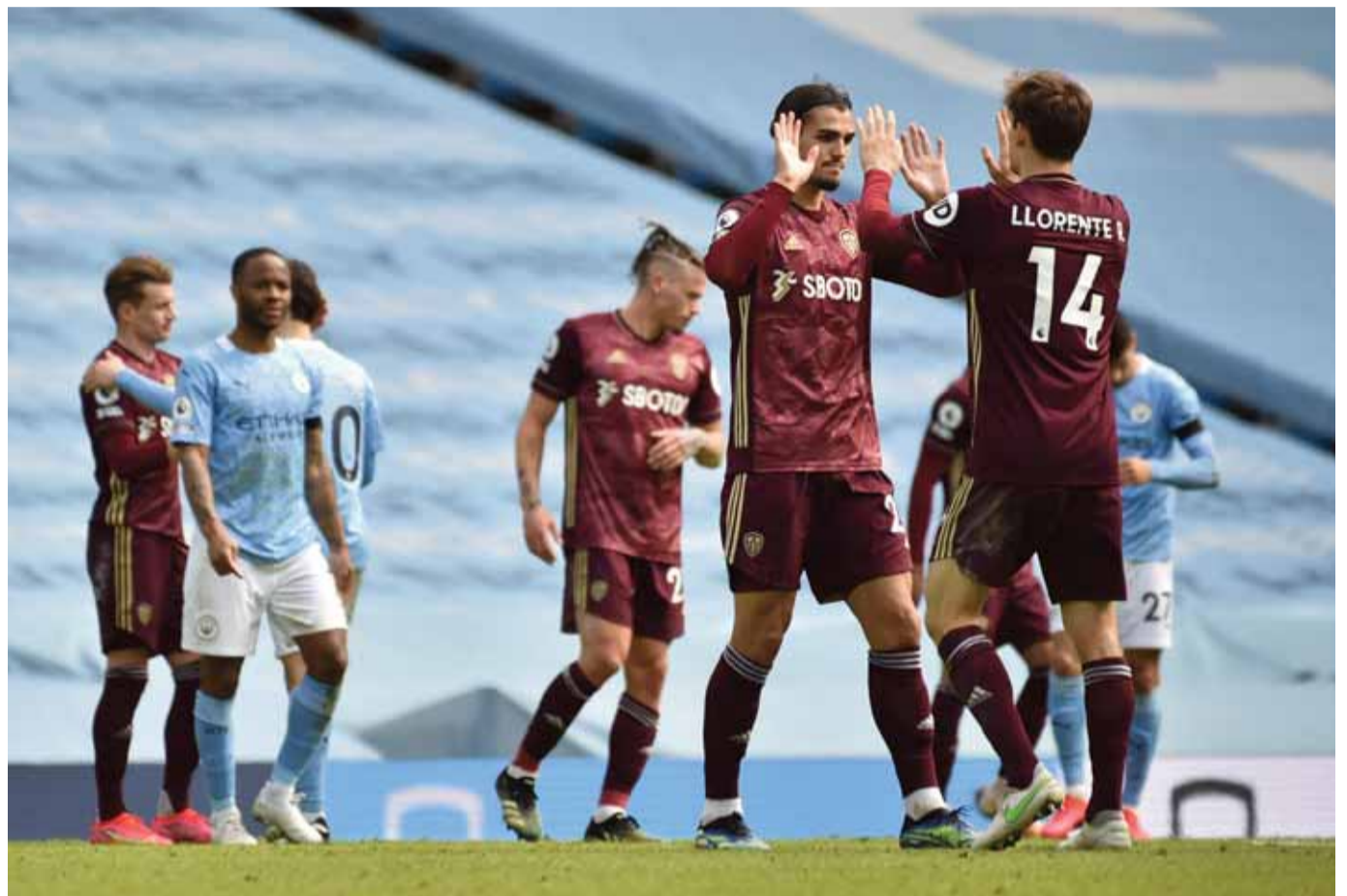
MANCHESTER: Leeds players celebrate at the end of the English Premier League football match between Manchester City and Leeds United at the Etihad Stadium in Manchester, north west England yesterday.

Liverpool had lost their previous six home league matches, but Alexander-Arnold clinched their first success in front of the Kop since December as the Reds avenged their humiliating 7-2 defeat at Villa in October. Villa striker Ollie Watkins scored a hat-trick in that rout and he was back on the scoresheet after 43 minutes. Taking a touch from John McGinn's pass into the Liverpool area, Watkins hit a low