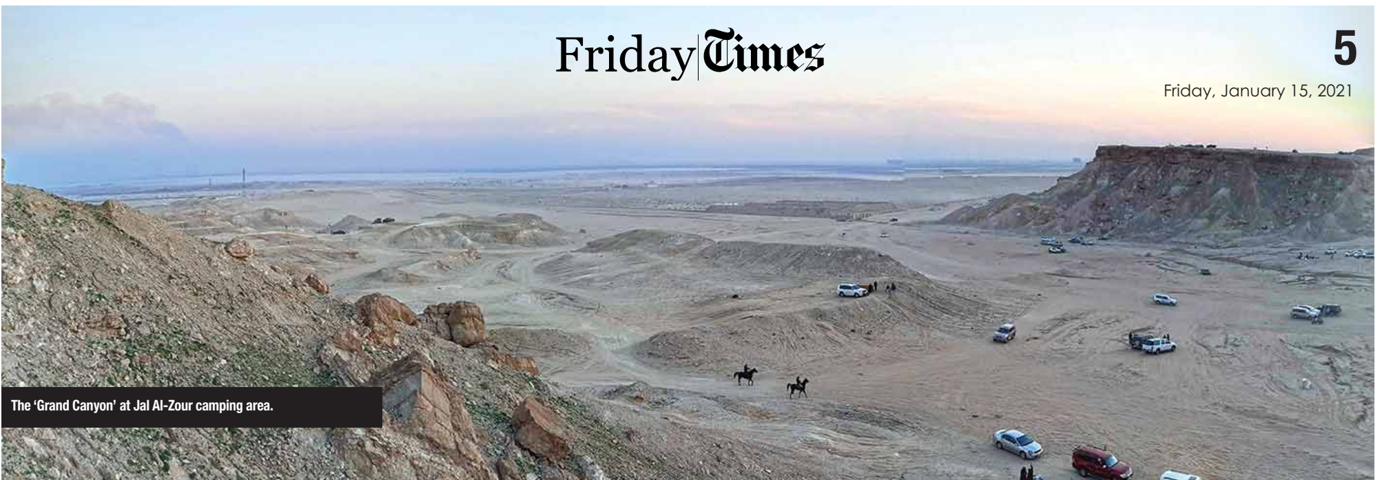
The 'Grand Canyon' at Jal Al-Zour camping area.

For lovers of luxury, there are plenty of glamping options, complete with elaborate 'kashta' setups. And if you've forgotten to bring along snacks or camping essentials, mobile baqalas are everywhere, selling everything from bottled water to ice to charcoal and grilling accessories. Fancy a bite that you don't have to cook up yourself? Food trucks offer a variety of mostly fast food and hot and cold beverages.