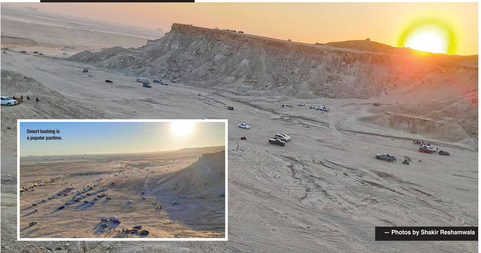
Desert bashing is a popular pastime.