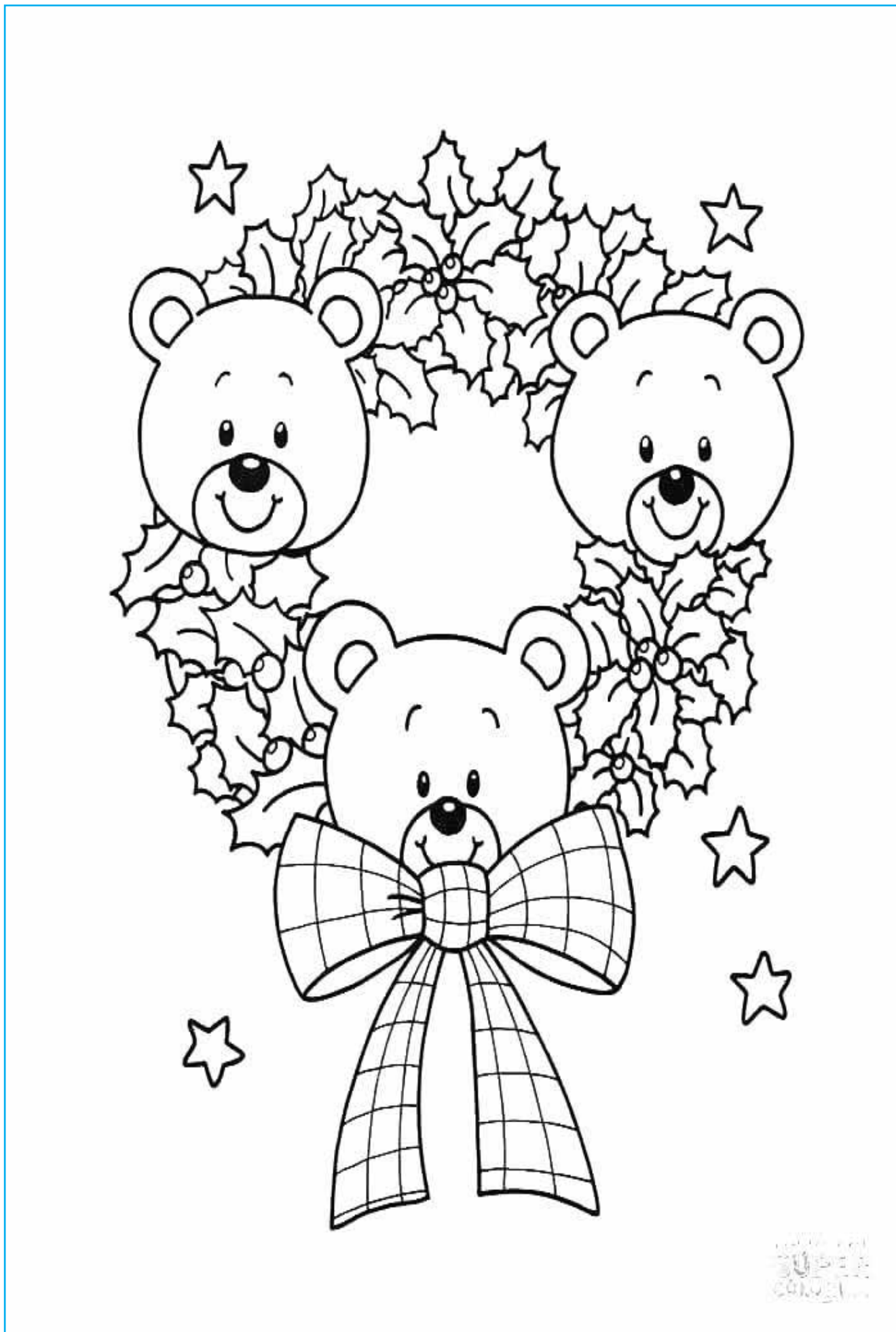
Illustration by SUPER COLORING