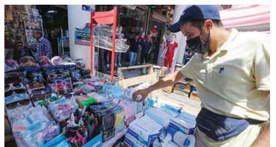
BAGHDAD: An Iraqi shopkeeper arranges facemasks at a stall on a market street yesterday.