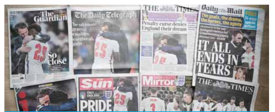
LONDON: National newspapers lead yesterday with the reaction of England after they lost the penalty shootout in the final of the UEFA Euro 2020 football tournament.