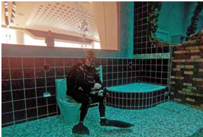
A diver explores a mock sunken city as he experiences Deep Dive Dubai.

The city of superlatives with the world's tallest tower among its many records, Dubai now has the deepest swimming pool on the planet complete with a "sunken city" for divers to explore. Deep Dive Dubai, which opened Wednesday but initially by invitation only, prides itself as "the only diving facility in the world" where you can go down 60 meters (almost 200 feet), 15 meters deeper than any other pool, as confirmed to AFP by Guinness World Records.