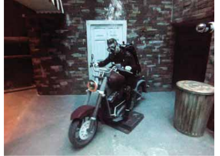
A diver rides a mock bike as he experiences Deep Dive Dubai.