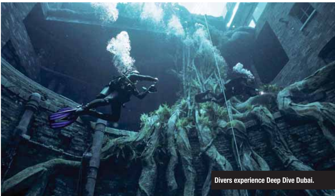
Divers experience Deep Dive Dubai.