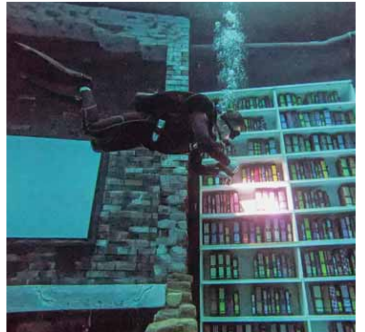
A diver browses mock books as he experiences Deep Dive Dubai.