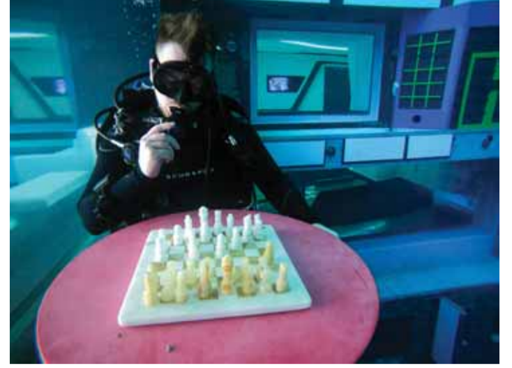
A diver plays mock chess as he experiences Deep Dive Dubai.