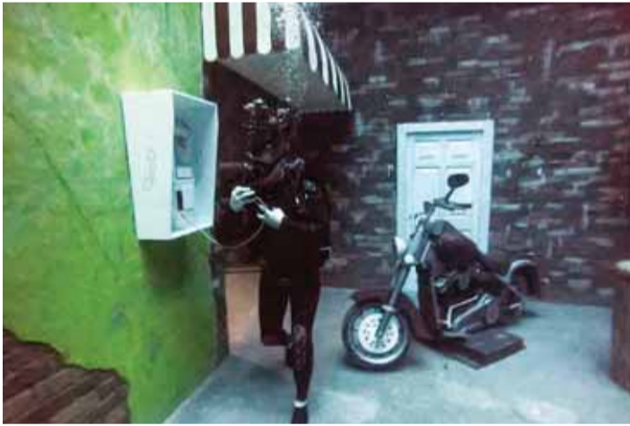
A diver uses a mock public phone as he experiences Deep Dive Dubai.