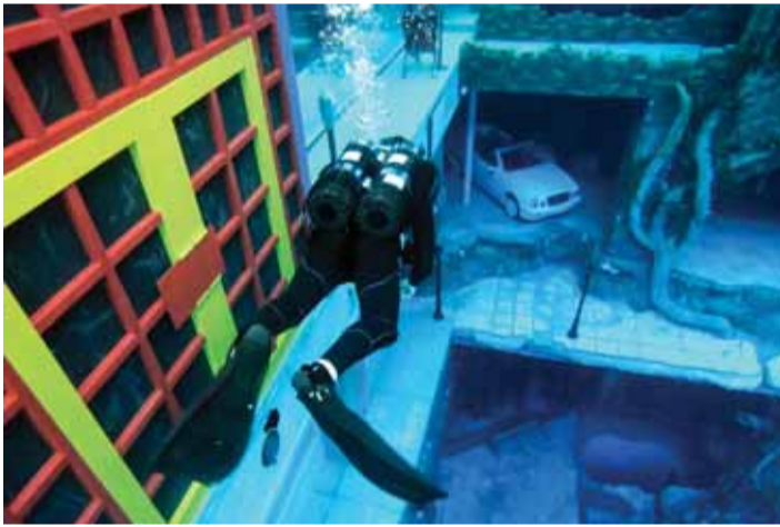
A diver explores a mock sunken city as he experiences Deep Dive Dubai.