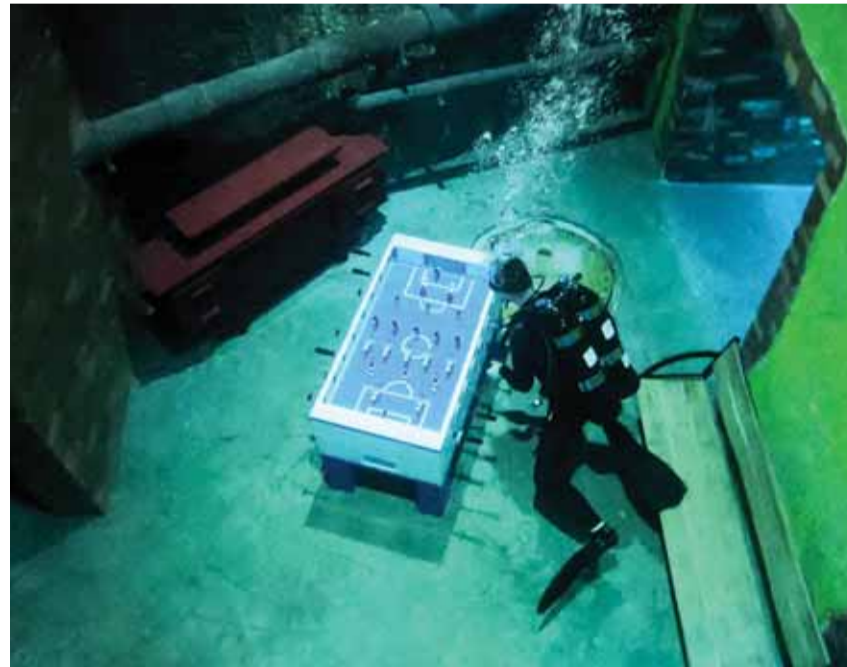
A diver experiences Deep Dive Dubai.

Divers play mock chess while experiencing Deep Dive Dubai, the deepest swimming pool in the world reaching 60m, in the United Arab Emirates.