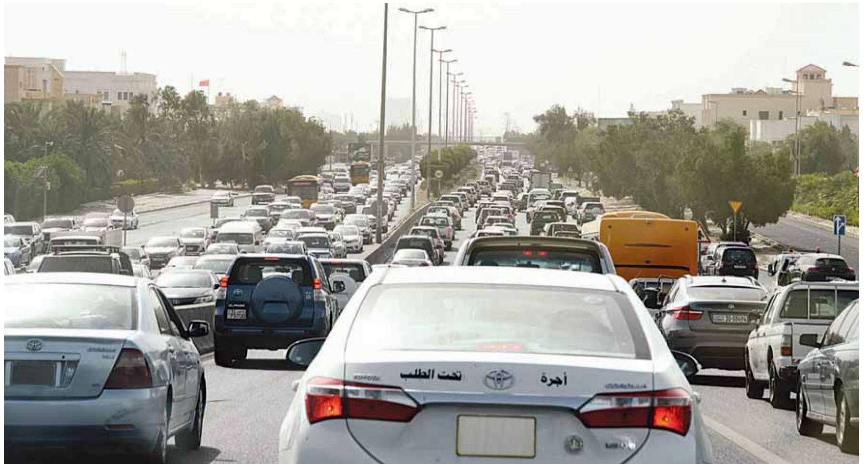
KUWAIT: A picture taken on Saturday shows heavy traffic on the Fourth Ring Road. Main highways in Kuwait were heavily congested on the weekend, which has become the main gateway for people to meet their needs since the partial curfew started.