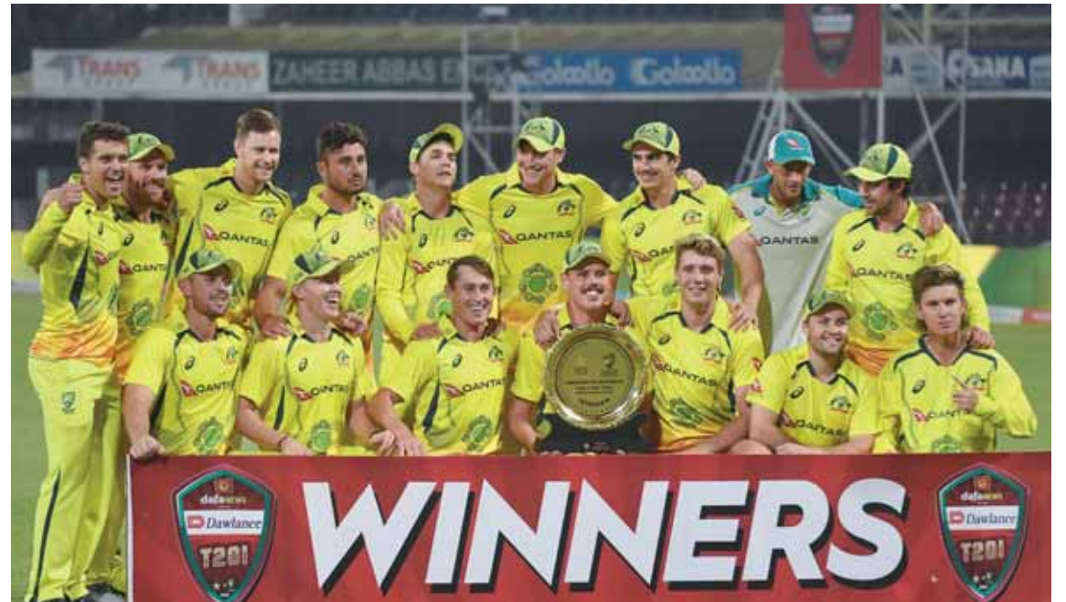
LAHORE: Australia's players pose with the trophy after winning a Twenty20 international cricket match between Pakistan and Australia at the Gaddafi Cricket Stadium on April 5, 2022.

But Green dismissed Rizwan with the fourth ball of his first over and Fakhar Zaman off a full toss next ball to pull things for Australia. Azam drove Green for a four to bring up his 26th T20I fifty off just 33 balls. He smashed spinner Adam Zampa for a six but next ball holed out at deep cover. Khushdil Shah chipped in with 21-ball 24 and Usman Qadir six-ball 18 not out as Pakistan managed 50 runs in the last five overs, losing five wickets. Marnus Labuschagne, Ben Dwarshuis and Green were handed Twenty20 international debuts by Australia. — AFP