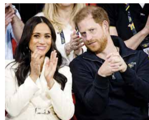
THE HAGUE: The Duke and Duchess of Sussex, Prince Harry and his wife Meghan Markle, visit the sitting volleyball section of the fifth edition of the Invictus Games on April 17, 2022.

Just before the prince's arrival on Friday, the Ukrainian team made their own arrival to great applause. The team of 19 people were present in the Netherlands to take part but said they regretted the