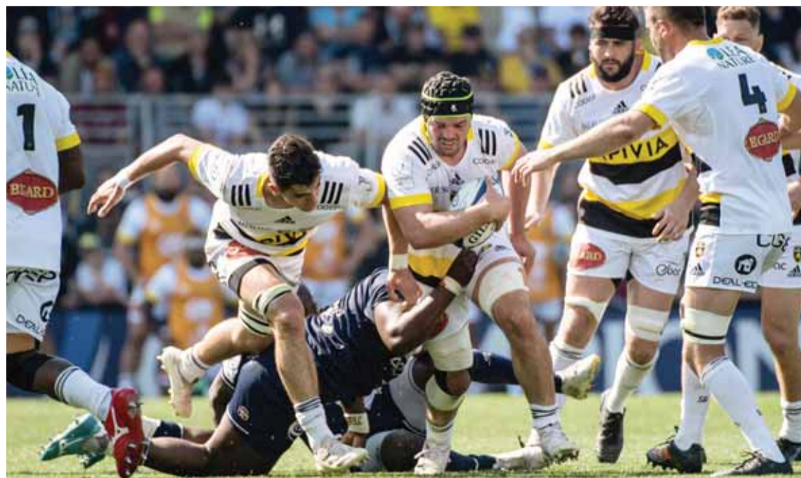
LA ROCHELLE, France: La Rochelle's Gregory Alldritt runs with the ball during the European Champions Cup rugby union match between La Rochelle and Union Bordeaux-Begles at The Marcel Deflandre Stadium on April 16, 2022.

Bordeaux's chances crumbled when they were