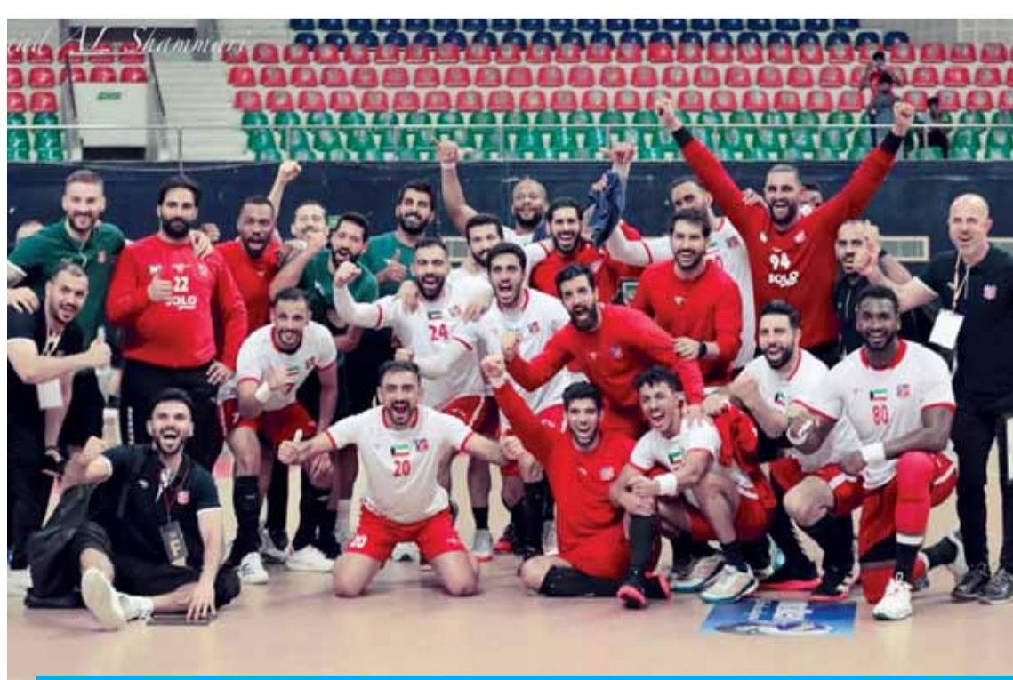
HYDERABAD, India: Kuwait Club of Kuwait team members celebrate after beating Bahrain's Najma Club's 28-23.

The Asian Men's Club League Handball Championship (AHF Club League Championship) is the official competition organized by Asian Handball Federation for the men's handball clubs of Asia, and takes place every year. In addition to crowning the Asian champions, the tournament also serves as a qualifying tournament for the IHF Super Globe.