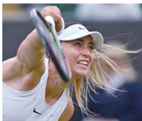
WIMBLEDON: Spain's Paula Badosa returns the ball to Romania's Irina Bara during their women's singles tennis match on the fourth day of the 2022 Wimbledon Championships at The All England Tennis Club in Wimbledon on June 30, 2022.