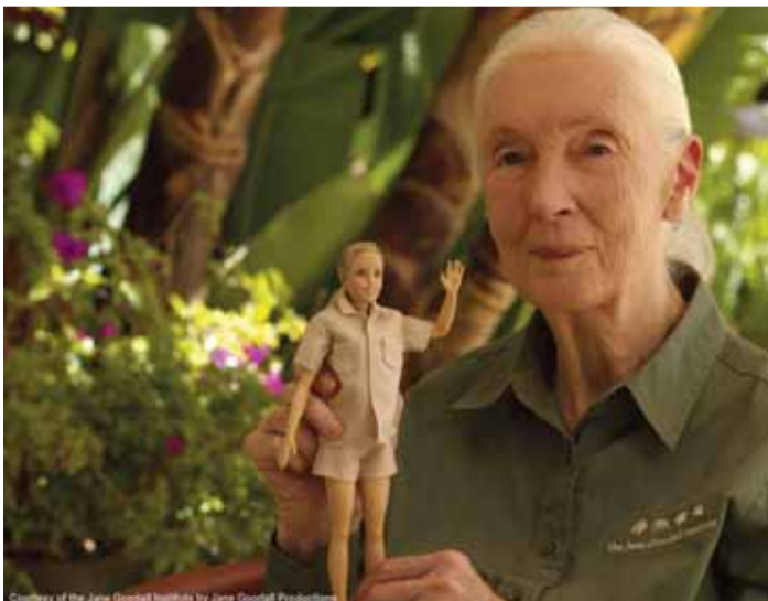
In this undated handout image courtesy of the Jane Goodall Institute, famous British primatologist Jane Goodall holds a Barbie doll in her likeness.

Before Goodall, the toy-maker had produced dolls modeled off tennis star Naomi Osaka, the co-creator of AstraZeneca's Covid vaccine, Sarah Gilbert, and an anonymous female "robotics engineer." "My heroes, my models were Tarzan, Dr. Dolittle," said Goodall. "There weren't women doing the kind of things I wanted to do... so in all my dreams, I was a man." To all the little girls who like her would like to be changemakers, the primatologist recommends to "go for a walk in nature, learn to love it and then protect it."—AFP