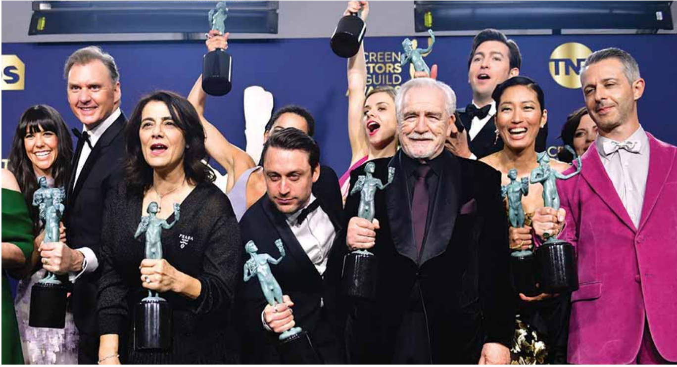
In this file photo Scottish actor Brian Cox (third right), US actor Jeremy Strong (right) and members of the cast from "Succession" pose with the award for Outstanding Performance by an Ensemble in a Drama Series, in the press room during the 28th Annual Screen Actors Guild Awards in Santa Monica, California.