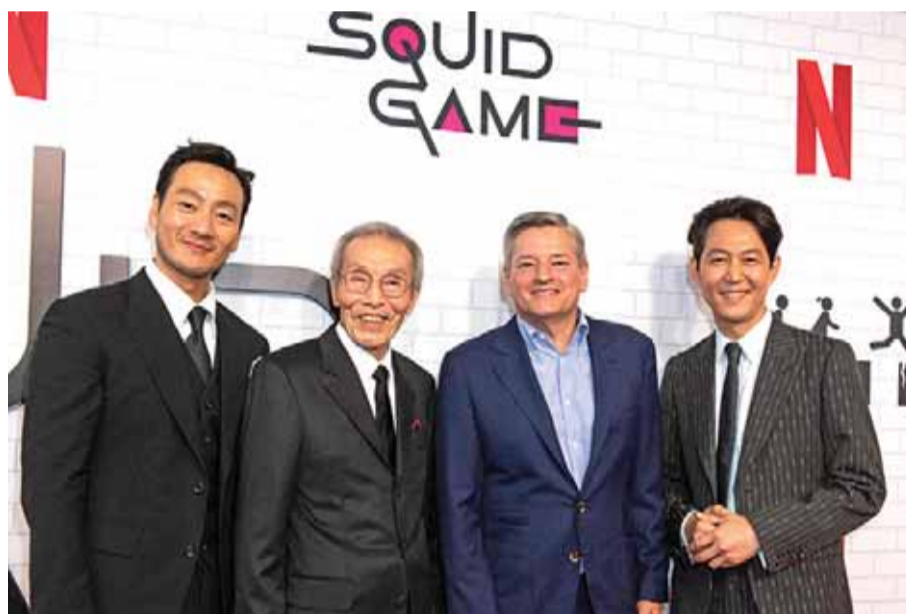
In this file photo (from left) South Korean actors Park Hae-soo, O Young-so, Netflix CEO Ted Sarandos and South Korean actor Lee Jung-jae (right) attend Netflix's 'Squid Game' Special Event at Netflix FYSEE at Raleigh Studios in Los Angeles, California.

Television productions have ramped back up, after being shuttered or scaled back in the first year of the coronavirus pandemic. "Succession" will compete for best drama with "Squid Game," a violent South Korean satire in which society's marginalized compete for cash in fatal versions of children's games-and Netflix's most-watched series ever. "Squid Game" also picked up multiple