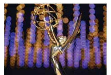
File photo shows an Emmy statuette at the 70th Emmy Awards Governors Ball press preview at the LA Live Event Deck in Los Angeles, California.

More unusually, it pits basketball great Kareem Abdul-Jabbar ("Black Patriots: Heroes Of The Civil War") against former US president Barack Obama ("Our Great National Parks.") Obama will find out in September if he can add an Emmy to his Nobel Peace Prize... and two Grammy Awards.