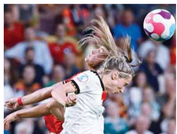
LONDON: Spain's midfielder Patricia Guijarro (left) vies for a header with Germany's defender Kathrin Hendrich during the UEFA Women's Euro 2022 Group B football match between Germany and Spain at Brentford Community Stadium in west London on July 12, 2022.

Popp was centre stage again as the hour mark approached, going down under what looked like a tug on the front of her shirt from Spain captain Paredes as she aimed to run clear on goal. French referee