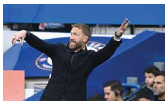
LONDON: Chelsea's English head coach Graham Potter gestures during the English Premier League football match between Chelsea and Aston Villa at Stamford Bridge in London on April 1, 2023.

That has proven not to be the case as Boehly and